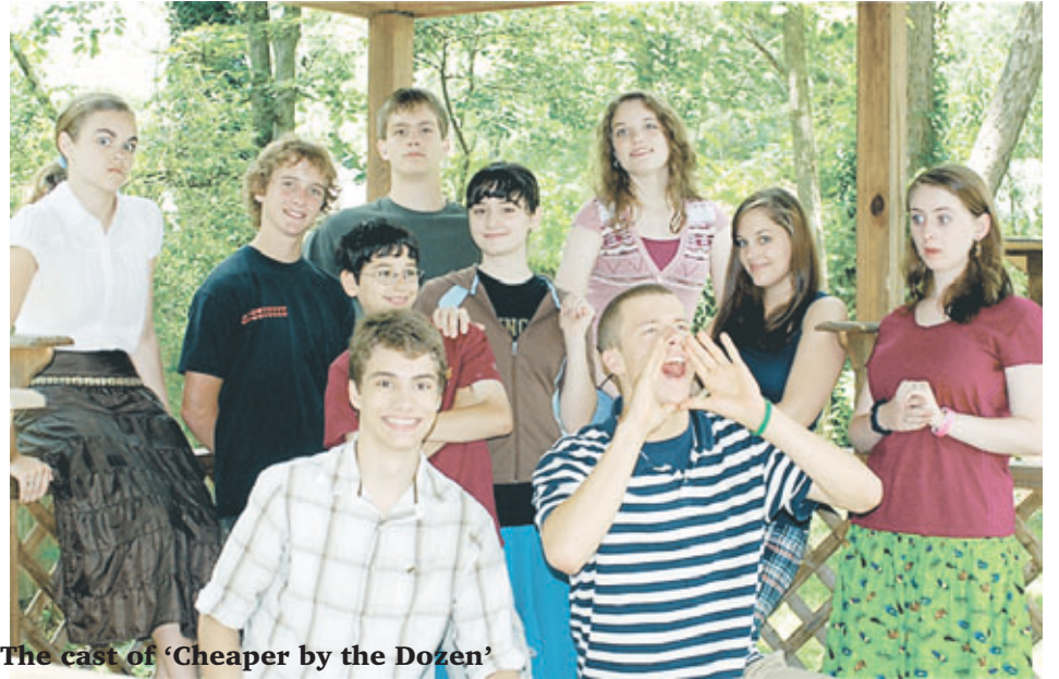
The cast of 'Cheaper by the Dozen'