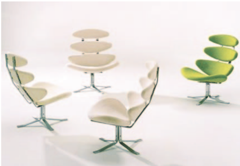
First produced in 1961 by Danish Designer Poul Volther, the Corona accent chairs retail for $649 apiece from Macy's (8000 Tysons Corner Center 703-893-4900).