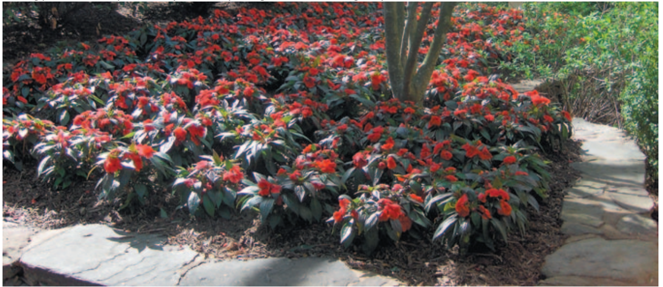
Blooms complement the elegant stonework