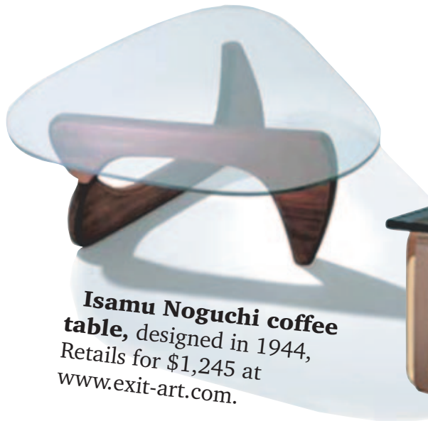
Isamu Noguchi coffee table , designed in 1944, retails for $1,245 at www.exit-art.com .