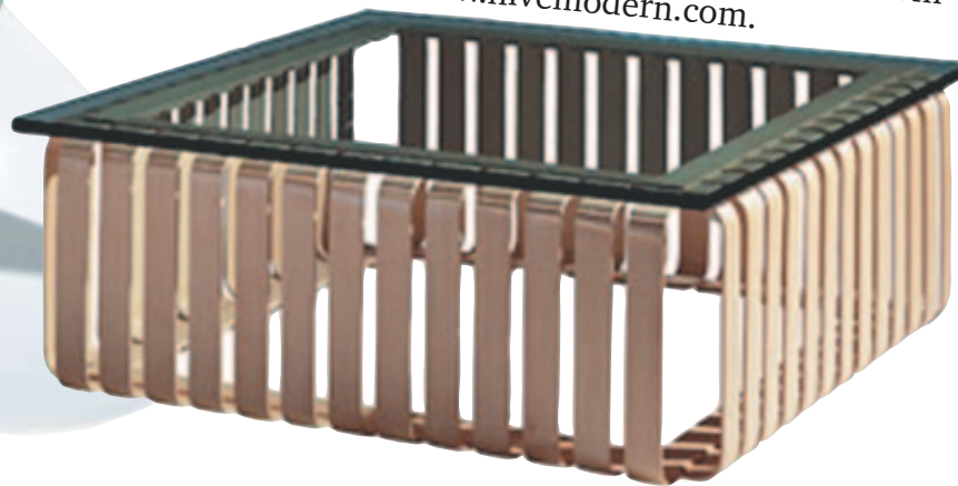
Frank Gehry Icing Coffee Table for Knoll. Retails for $3,219 from www.hivemodern.com .