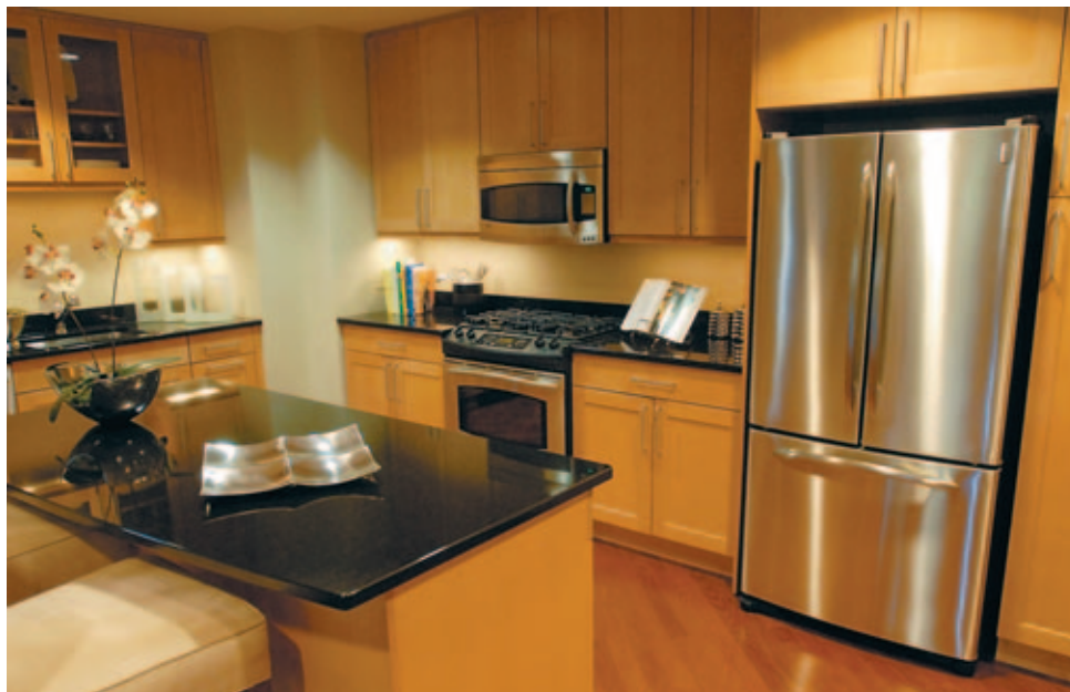
The Park Crest Condos in Tysons Corner are being sold and will soon be open.

careful choice when they bought a home at Park Crest in Tysons Corner. Both are in their early 60s and were looking for a home in Tysons Corner that would give them the convenience and security they felt they needed. The building they bought in will be open for residents later this year. It is a 19-story high rise and the