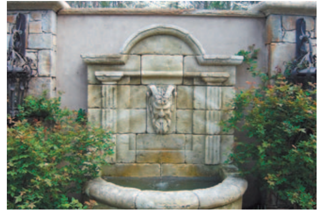
Visitors are greeted by the sound of water from many elegant fountains.