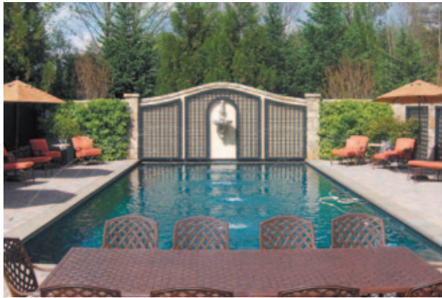
Water is a recurring theme, with a pool providing a setting for another of the many rooms of the garden.