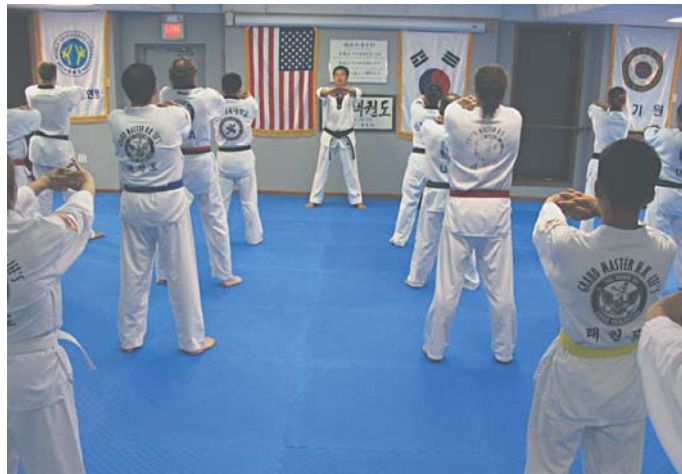
We Offer Morning and Evening Adult Classes

(free uniform with enrollment) or Call Now for a Free Trial Lesson with No Obligation!