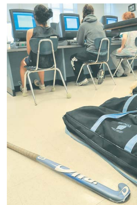
The field hockey team spent the late morning completing the online impact test in the computer lab.