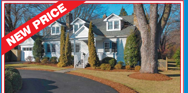
1256 Spring Hill Road, McLean $895,000