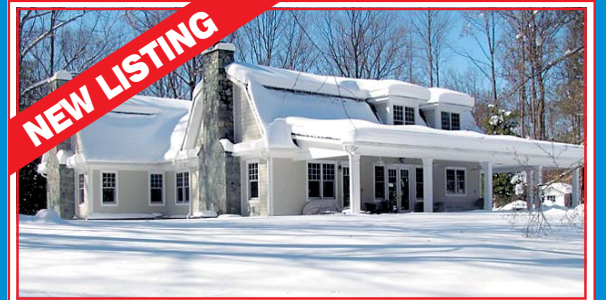
938 Leigh Mill Road, Great Falls $2,645,000