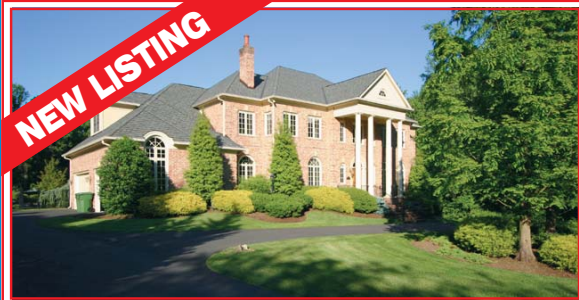
1221 Towlston Grange Road, Great Falls $2,650,000