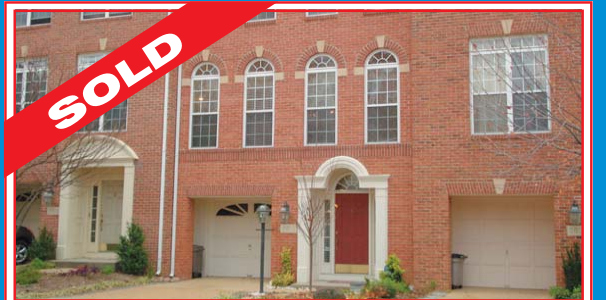
2810 Laura Gae Circle, Vienna $579,000