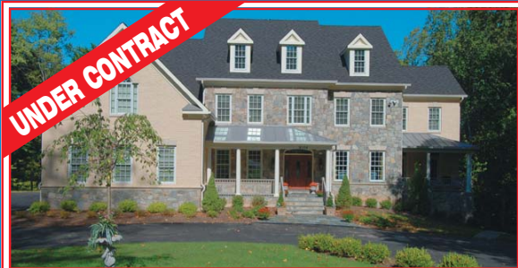
9106 Mine Run Drive, Great Falls $2,250,000