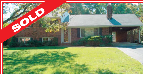
6911 Bright Avenue, McLean $798,000