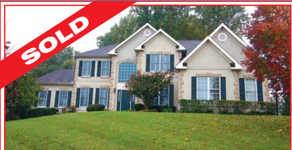
10519 Dunn Meadow Road, Vienna $1,090,000