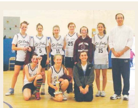
St. John girls received the Sportsmanship Award at the end of their last season together.