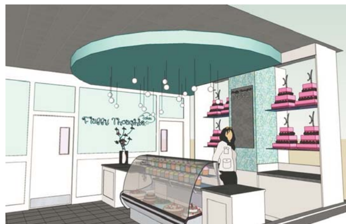
Circle Design Studio of Roanoke designed the interior of the bakery.