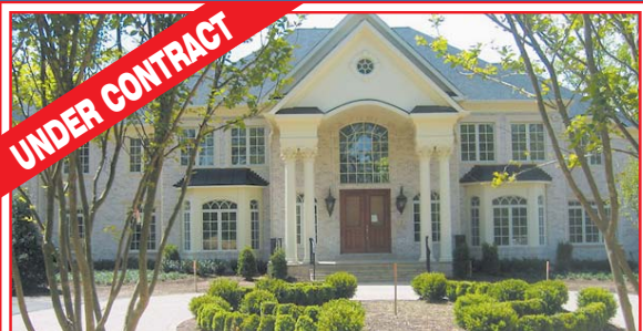
8651 Old Dominion Road, McLean $2,475,000