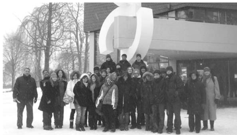
The McLean High School Orchestra's recent visit to Detmold, Germany marked the 15th year of the joint program between the McLean High School Orchestra and the Grabbe Gymnasium Detmolder Jugendorchester.