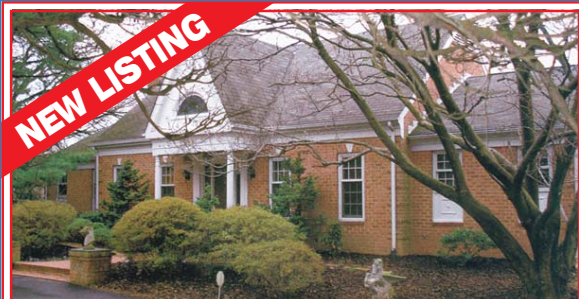
650 Seneca Road, Great Falls $1,000,000