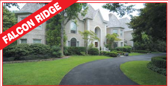
10010 High Hill Place, Great Falls $4,499,000