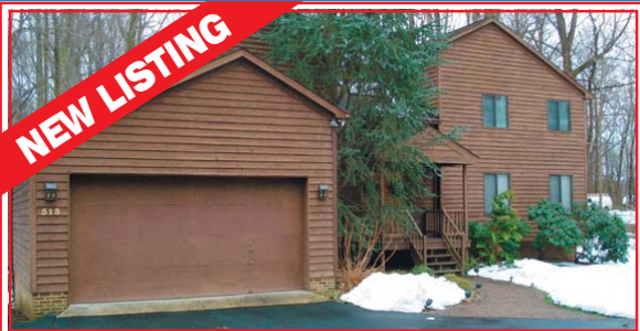
513 Springvale Road, Great Falls $895,000