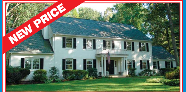
1143 Daleview Drive, McLean $1,599,000