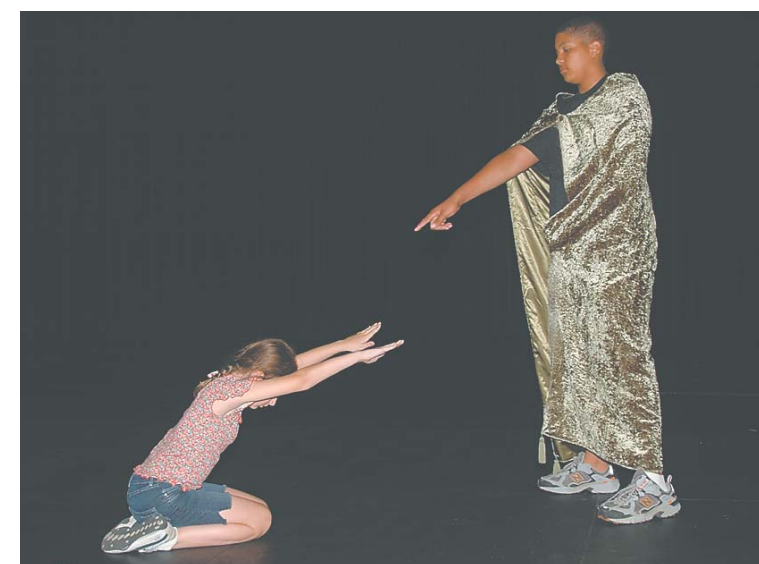
Two actors rehearse in theater camp.