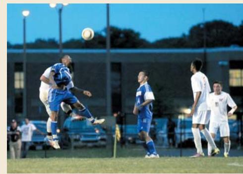
The Robinson boys' soccer team defeated Mount Vernon in the regional quarterfinals on May 24.