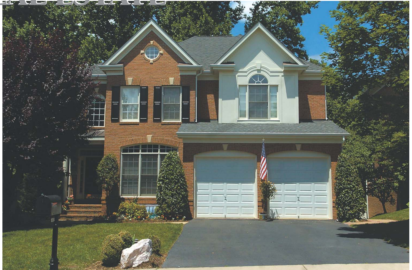
1 10094 Daniels Run Way, Fairfax — $898,500