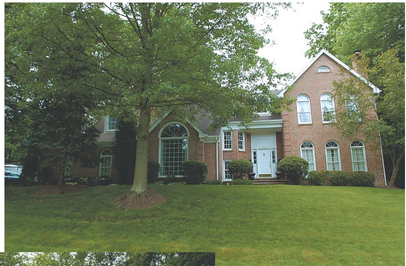
5 10645 Canterbury Road, Fairfax Station — $850,000