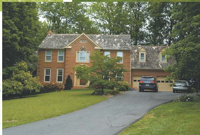
6 7827 Valley Drive South, Fairfax Station — $840,000