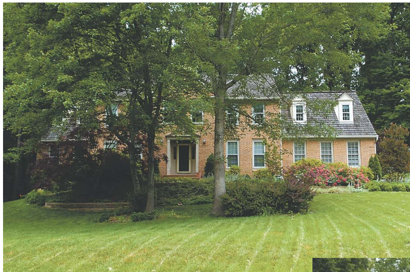
3 7104 Laketree Drive, Fairfax Station — $862,500