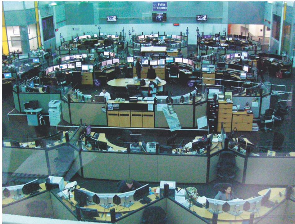
A bird's-eye view of the EOC operations floor for Fairfax County 911, police and fire dispatchers, VDOT and State Police inside the McConnell Public Safety and Transportation Operations Center.