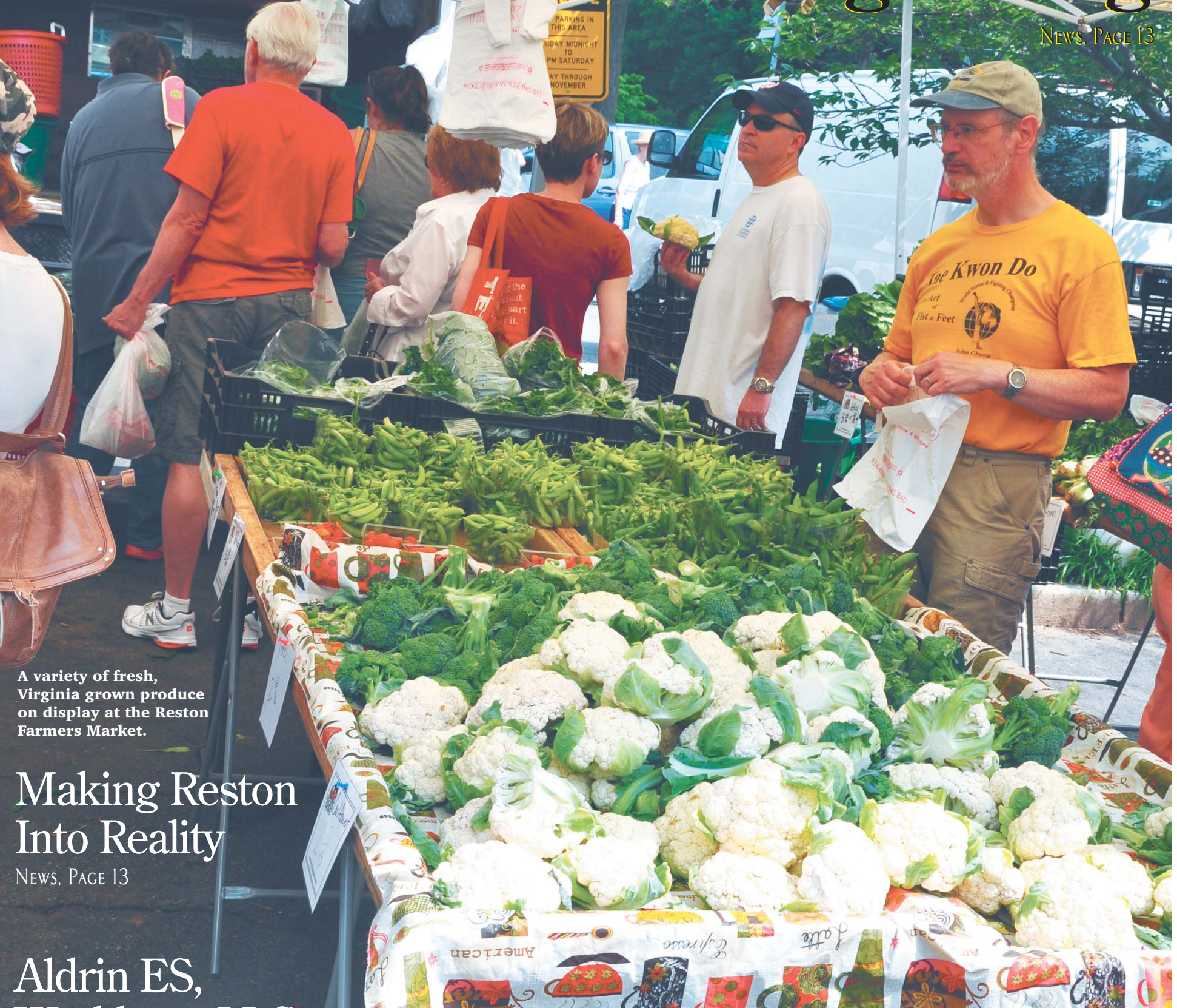
A variety of fresh, Virginia grown produce on display at the Reston Farmers Market.