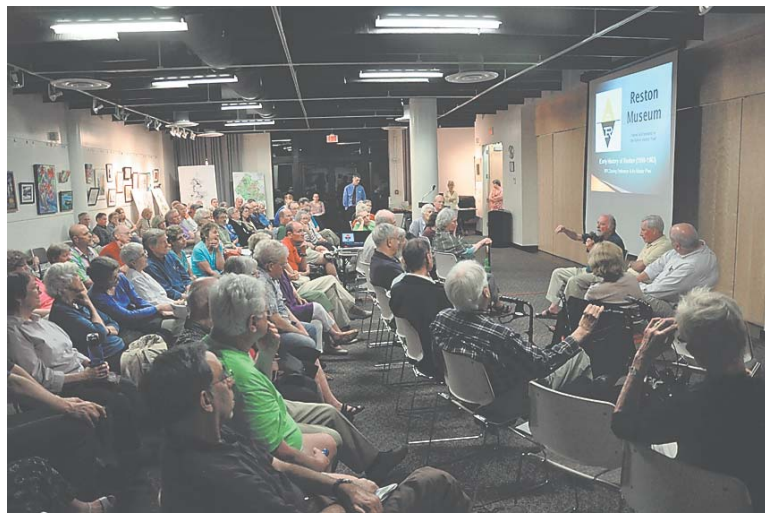
The Reston Historic Trust presents the story of the early planning of Reston at the Reston Community Center Lake Anne Thursday, May 24.