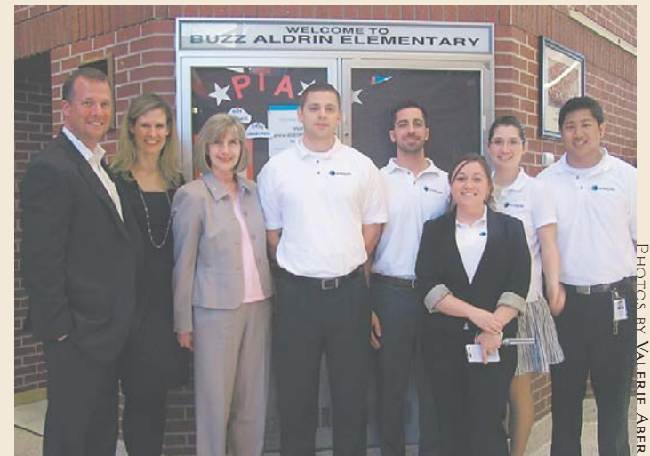
Aldrin Elementary School welcomes Worldgate LLC as a business partner.

The next presentation by the Reston Historic Trust will be Thursday, June 28 at 7 p.m. and will cover the building of Lake Anne Village Center from 1963 to 1965. It will take place at the Reston Community Center Lake Anne. More information can be found at www.restonmuseum.org .