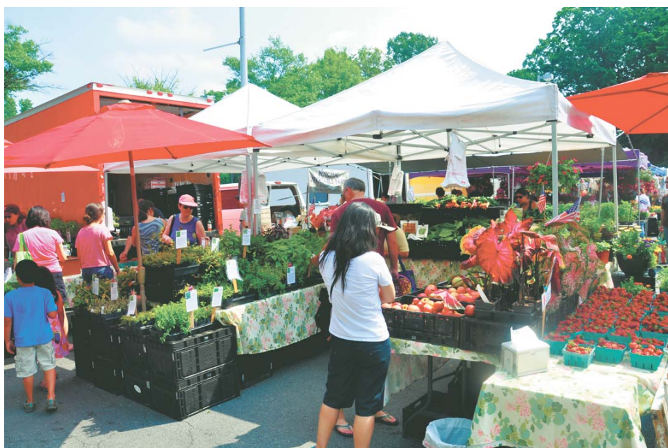
Guests at the Reston Farmers Market browse fresh fruits and vegetables at the Chelsey Vegetable Farms stand Saturday, May 26.