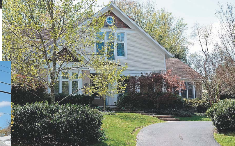
5 4900 Old Dominion Drive, Arlington — $1,057,500