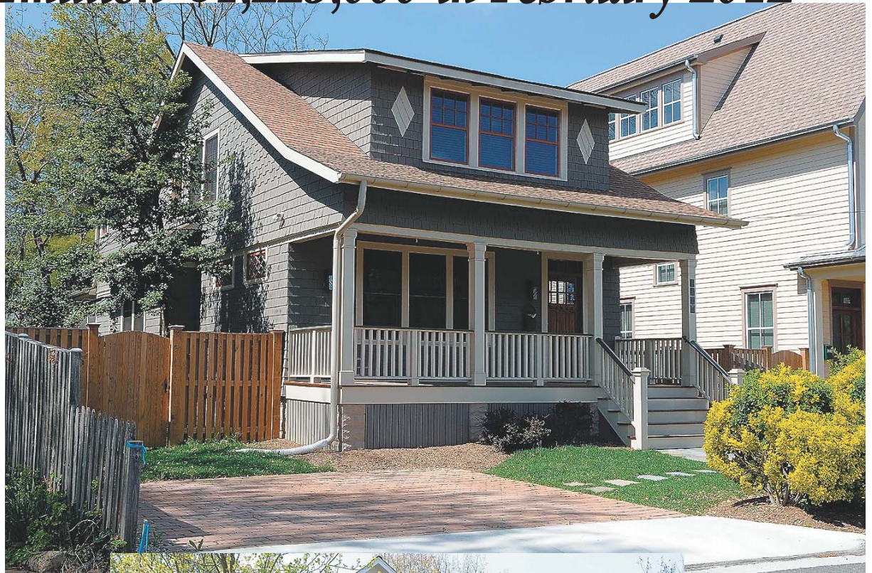
1 1626 Adams Street North, Arlington — $1,225,000