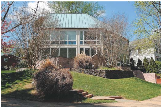
6 6559 24th Street North, Arlington —$1,040,000