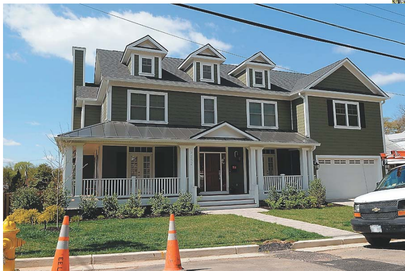
3 2252 Nottingham Street North, Arlington —$1,181,500