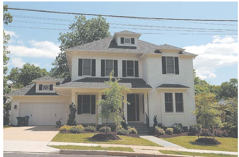
5 2407 Nelson Street North, Arlington — $1,485,000