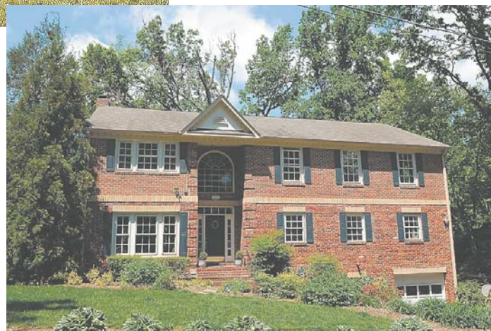
11 3025 Oakland Street, Arlington — $1,085,000