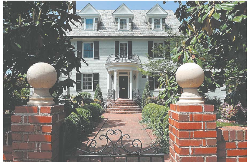
3 2012 Arlington Ridge Road, Arlington — $1,825,000