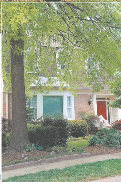
7 3837 Tazewell Street, Arlington — $1,135,000