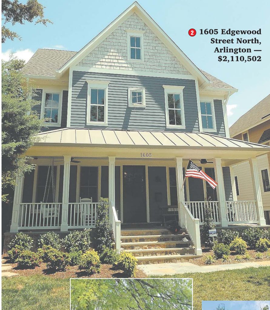
2 1605 Edgewood Street North, Arlington — $2,110,502