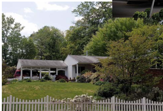
5 3900 Chesterbrook Road, Arlington — $900,000