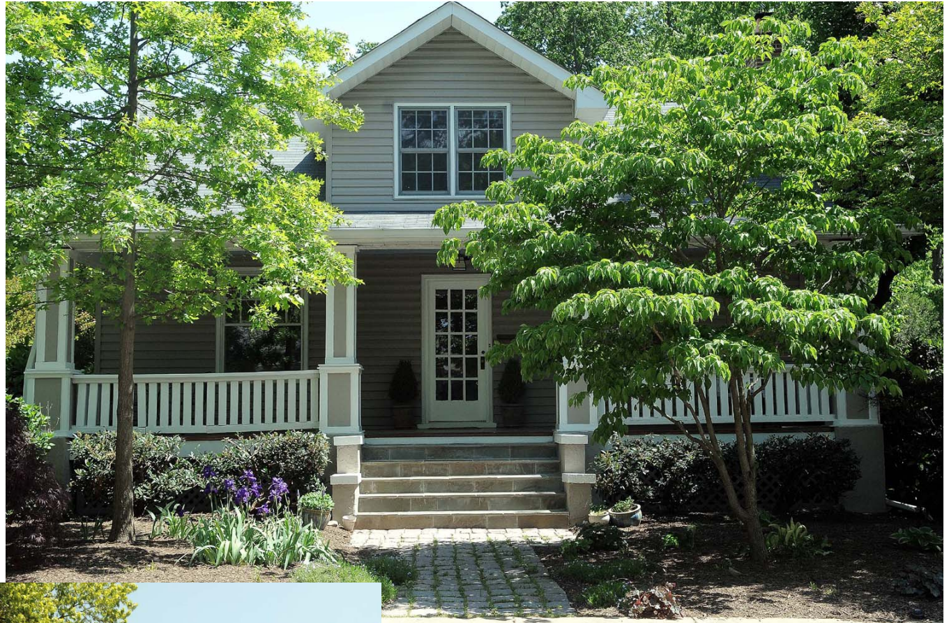
1 429 Lincoln Street North, Arlington — $996,000