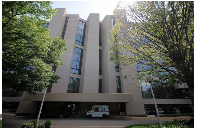
3 1101 Arlington Ridge Road South #916, Arlington — $915,000