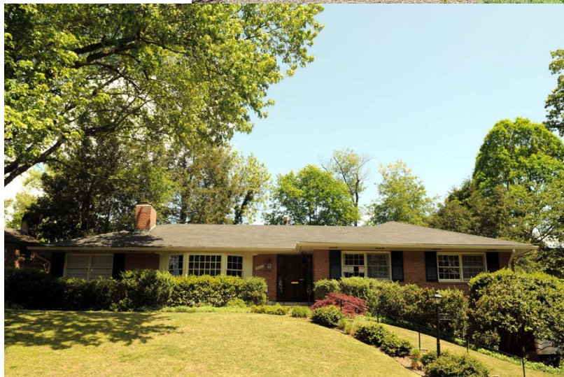
2 3631 Monroe Street North, Arlington — $930,000