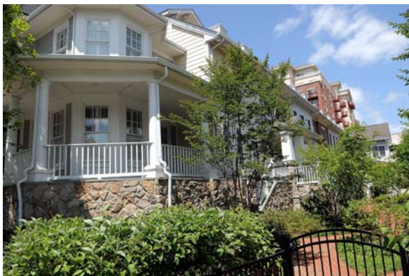
4 2849 11th Street North, Arlington — $911,667