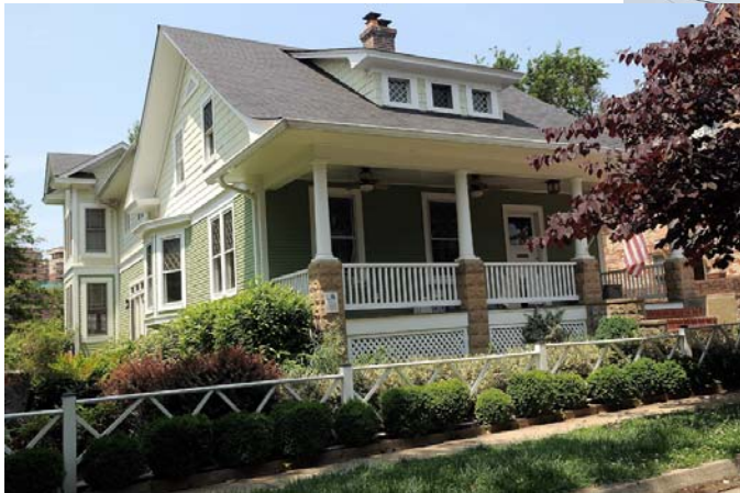
2 726 Danville Street North, Arlington — $1,230,000