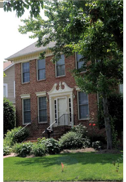
4 1530 Edgewood Street North, Arlington — $1,225,000