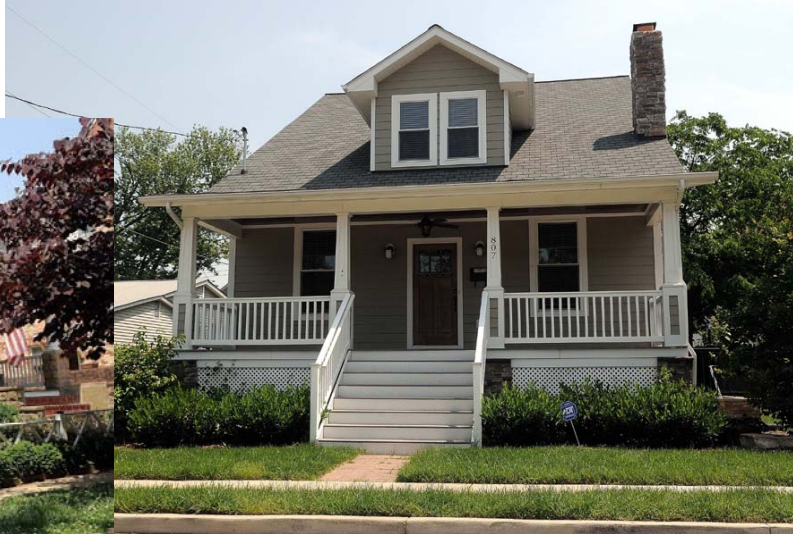
3 807 Lincoln Street North, Arlington — $1,225,000