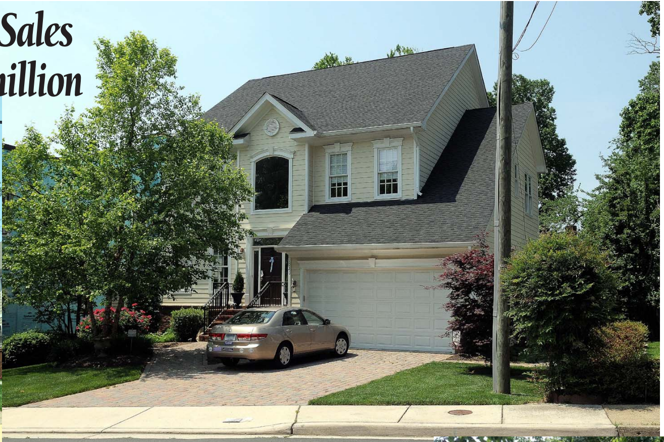
1 1020 Frederick Street, Arlington — $1,280,000