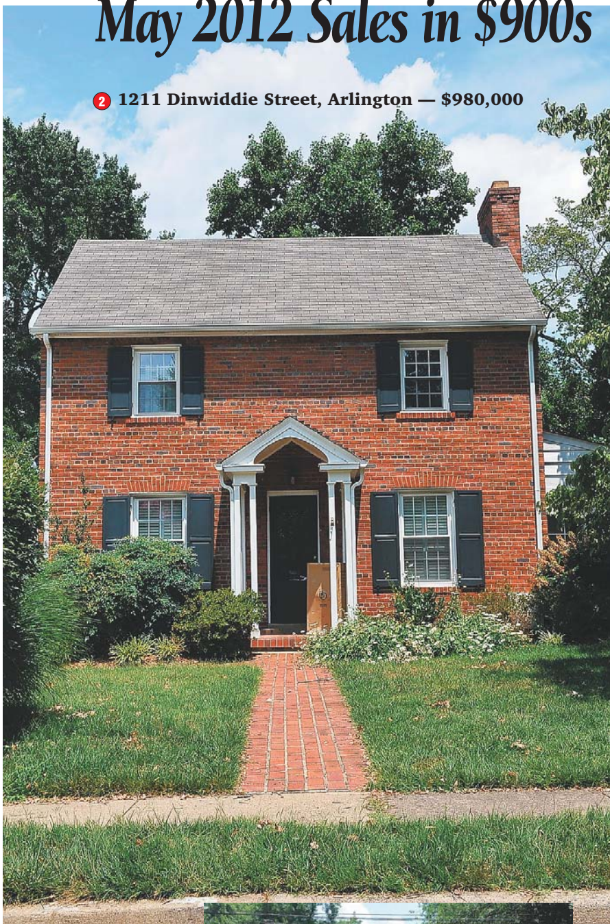
2 1211 Dinwiddie Street, Arlington — $980,000