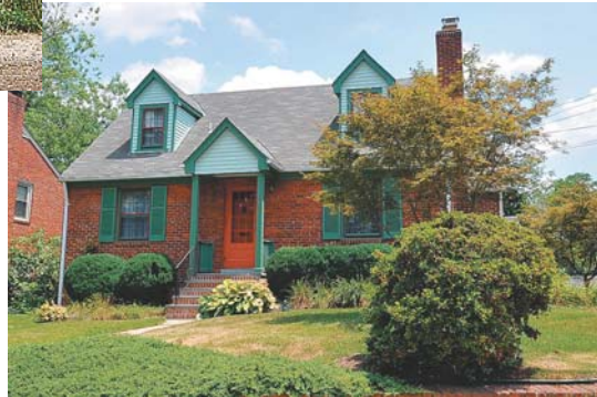
8 2301 Monroe Street, Arlington — $920,000