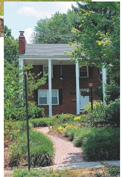
9 4400 17th Street North, Arlington — $900,000