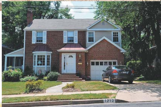
4 1212 Evergreen Street North, Arlington — $947,500