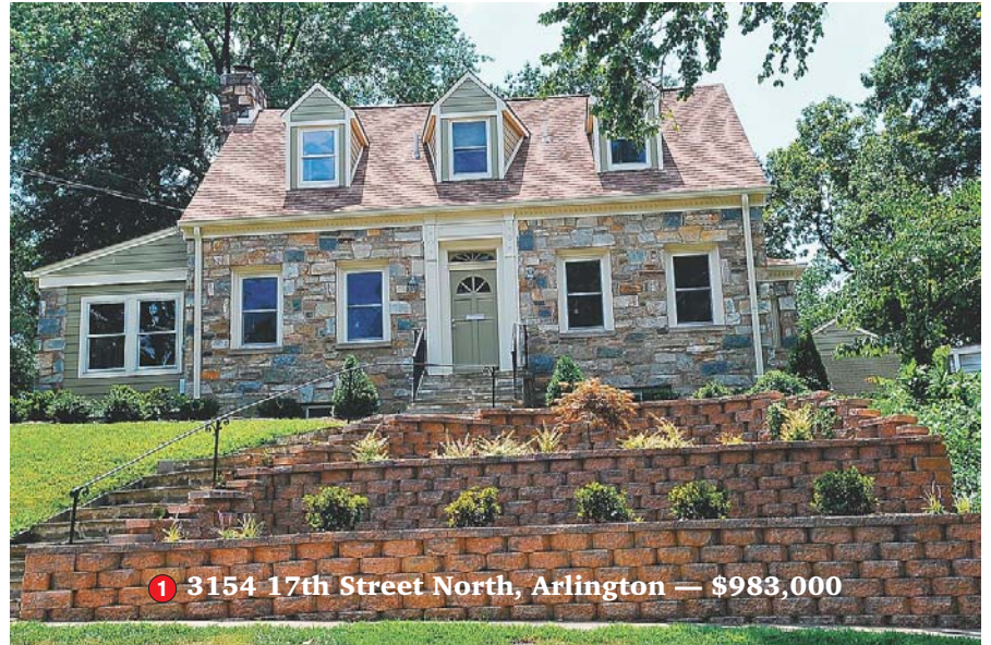
1 3154 17th Street North, Arlington — $983,000