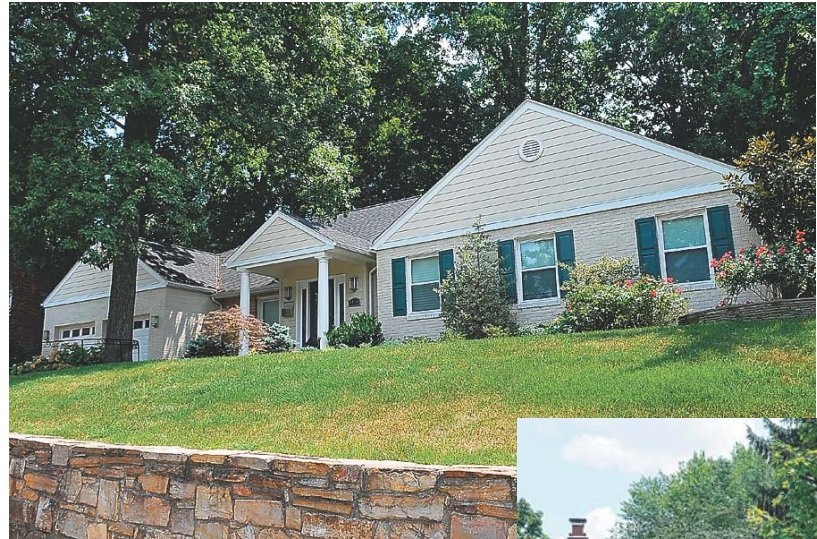
3 4914 Yorktown Boulevard, Arlington — $949,000