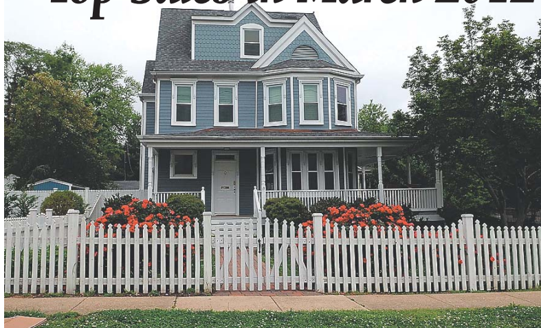
4 103 Monroe Avenue West, Alexandria — $975,000