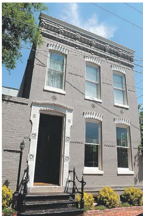
6 507 Wolfe Street, Alexandria — $949,500