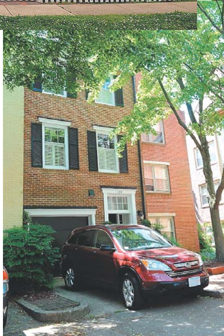
7 104 Waterford Place, Alexandria — $930,000