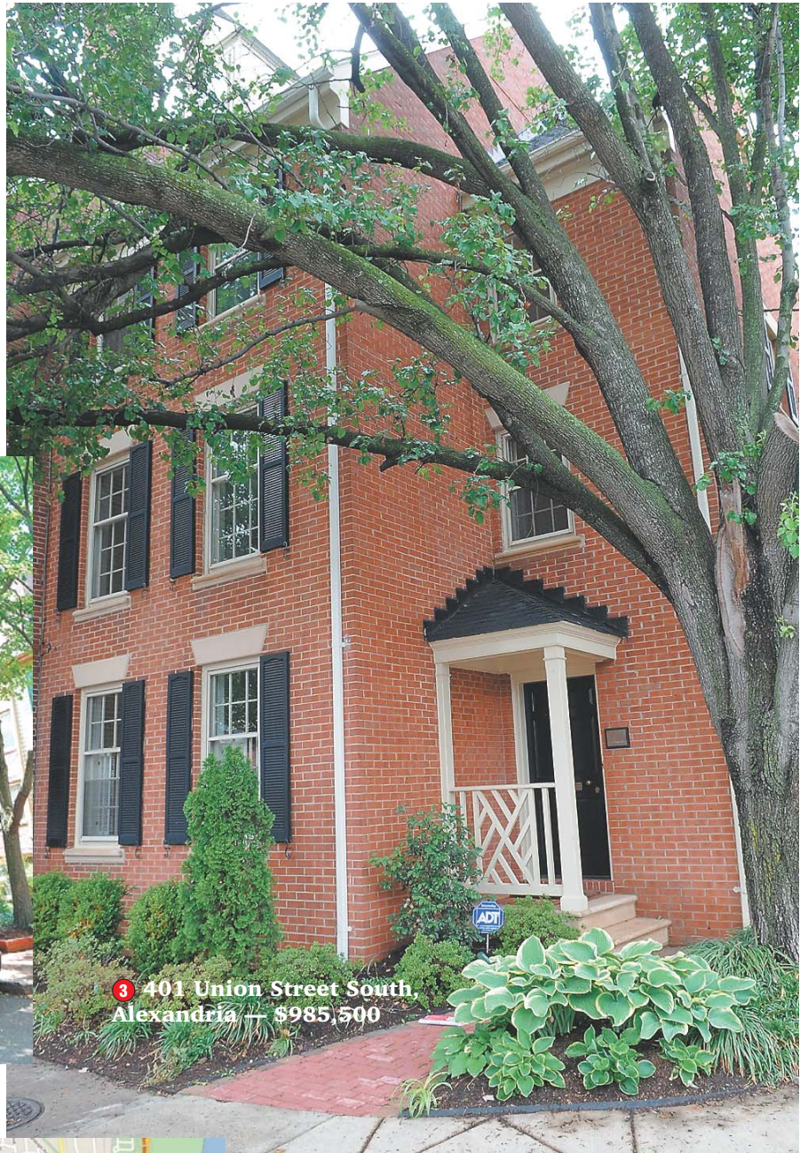
3 401 Union Street South, Alexandria — $985,500