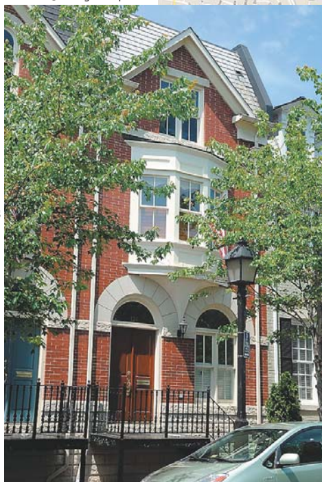
8 124 Columbus Street North, Alexandria — $927,500