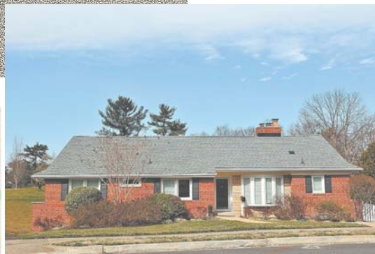
5 2749 Wakefield Street North, Arlington — $905,000