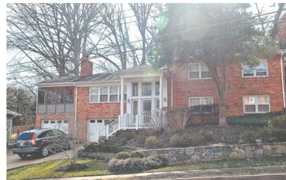
4 3660 Oakland Street, Arlington — $912,000