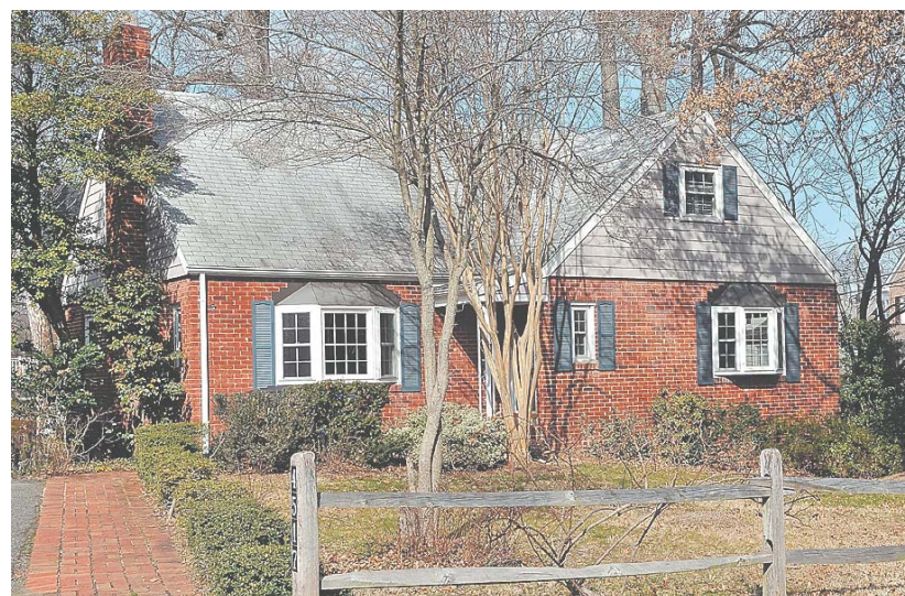
3 4517 Dittmar Road, Arlington — $912,500