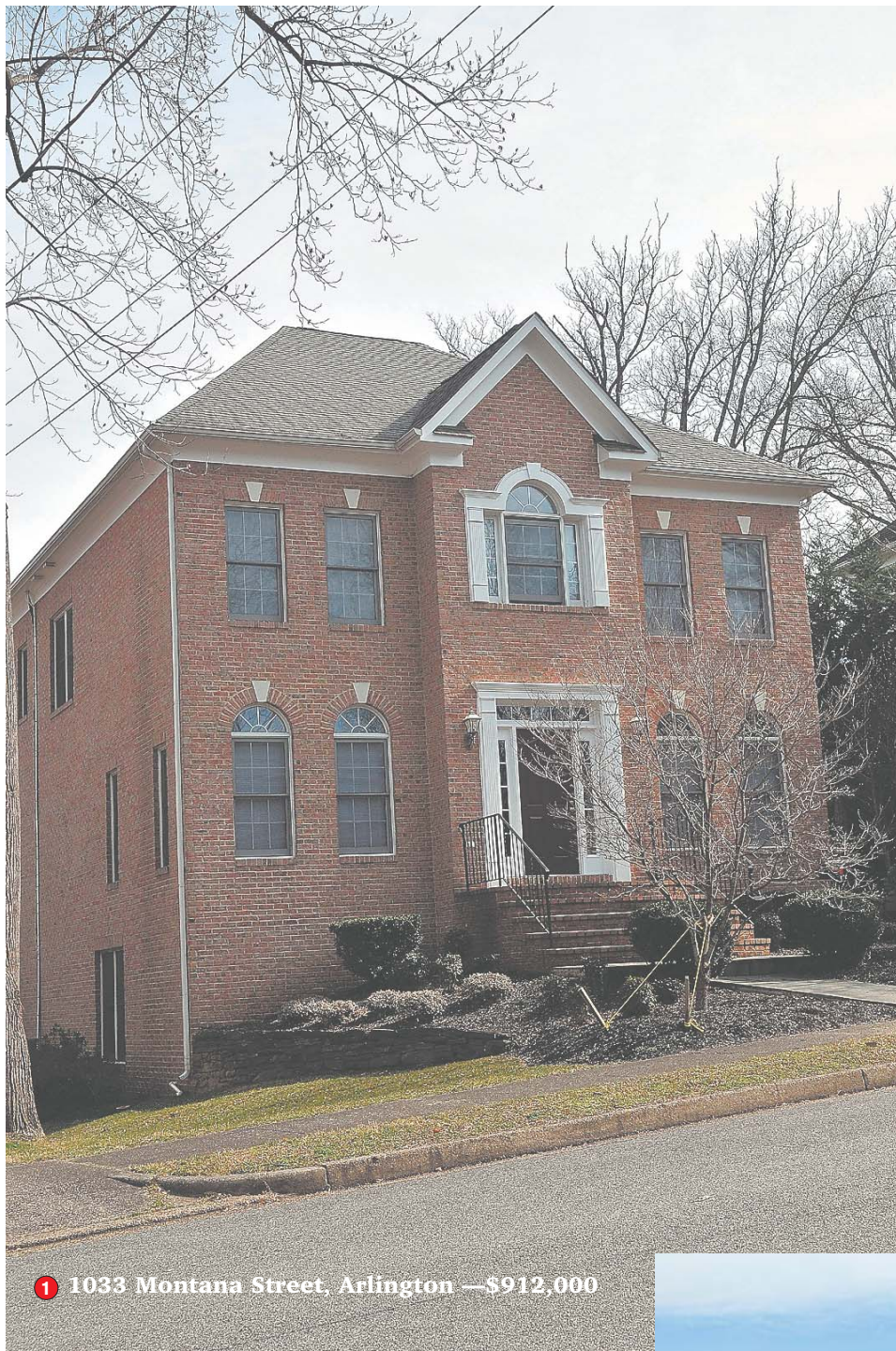
1 1033 Montana Street, Arlington — $912,000