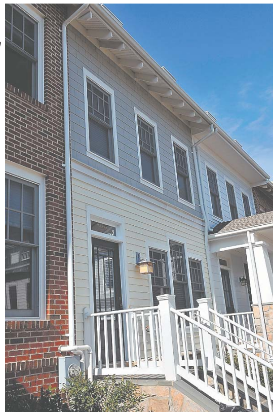
2 2811 11th Street North, Arlington — $920,000