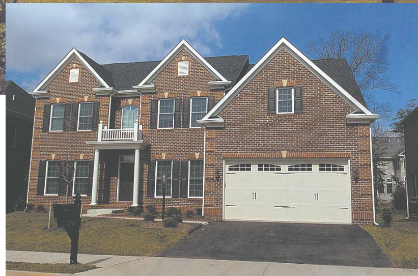
2 3967 Woodberry Meadow Drive, Fairfax — $932,462