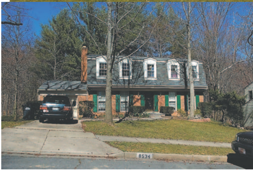
8 8534 Etta Drive, Springfield — $525,000