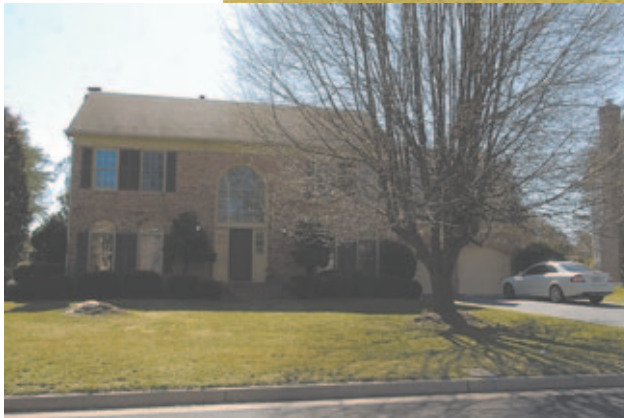
12 15411 Eagle Tavern Lane, Centreville — $515,000