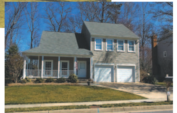
14 9014 Triple Ridge Road, Fairfax Station — $505,000