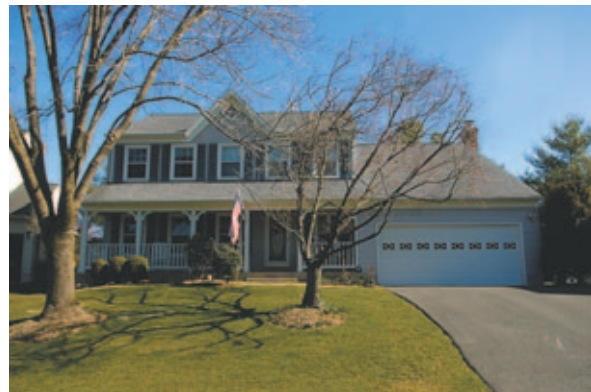
11 13331 Jasper Court, Fairfax — $515,000