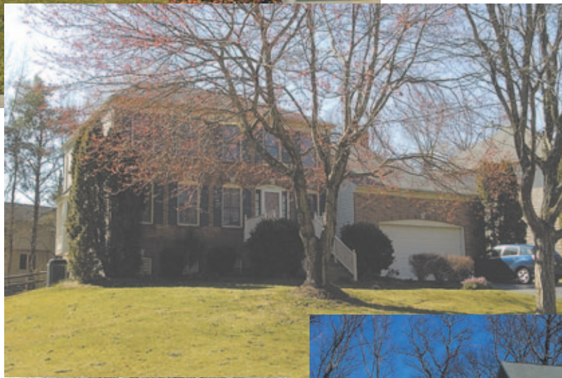
6 15337 Jordans Journey Drive, Centreville — $545,000