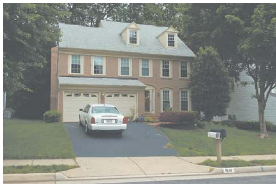
9 9114 Wood Pointe Way, Fairfax Station — $610,000