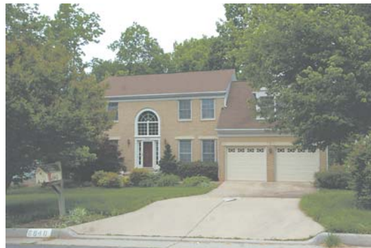
8 6840 Compton Heights Circle, Clifton — $610,000