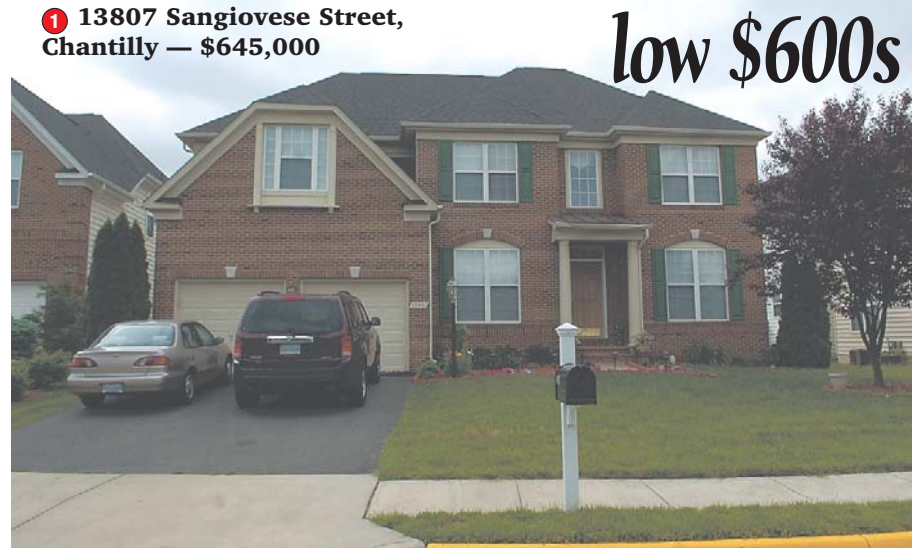
1 13807 Sangiovese Street, Chantilly — $645,000