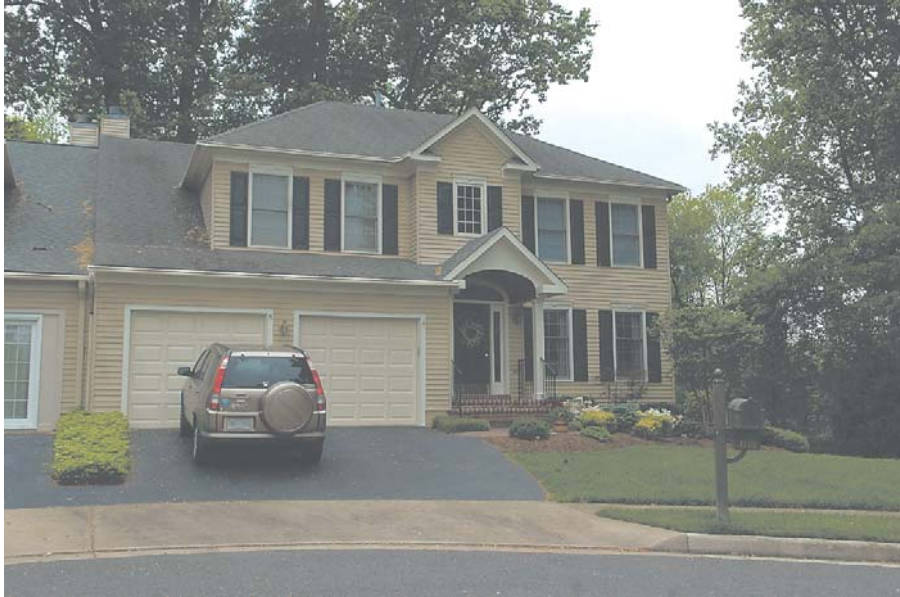
2 4110 John Trammell Court, Fairfax — $640,000