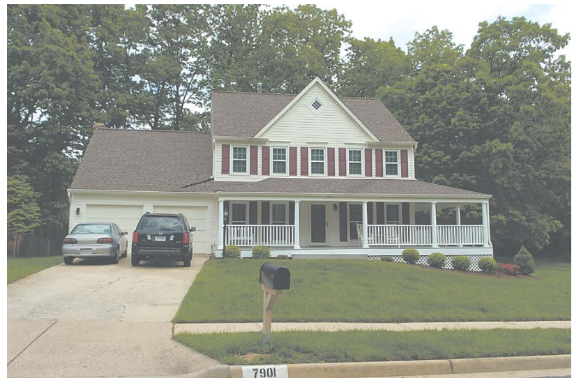
4 7901 Belleflower Drive, Springfield — $632,000