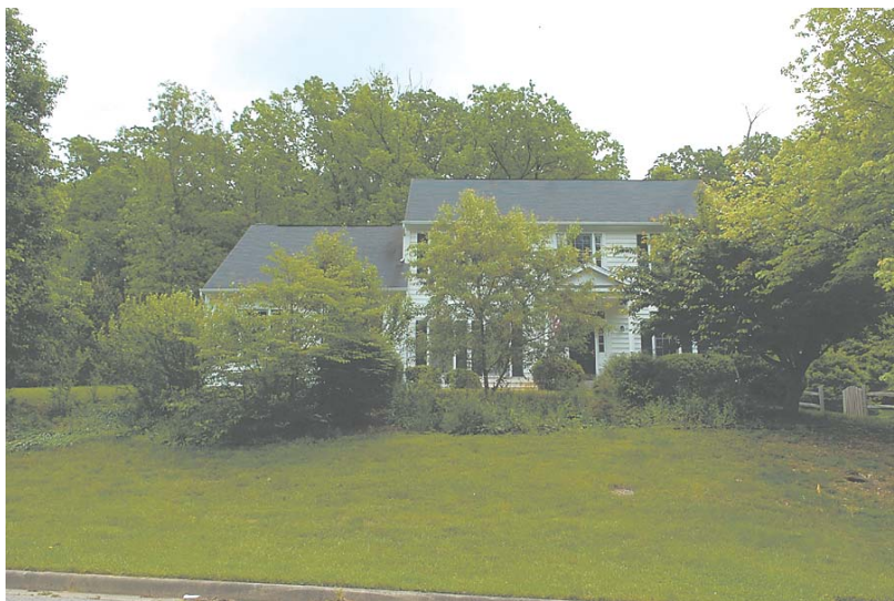
3 9225 Davis Drive, Lorton — $635,000