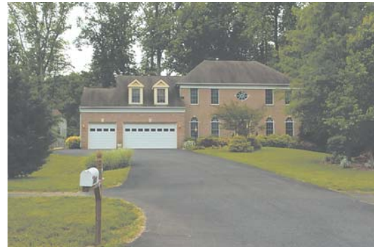
6 8823 Burke Road, Burke — $621,000