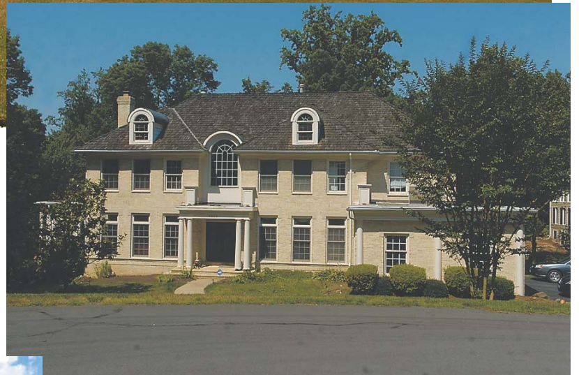
8 6906 Luton Hill Way, Clifton — $755,000