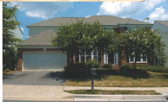
18 8140 American Holly Road, Lorton — $710,000