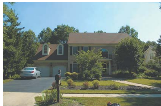
19 6613 Pelhams Trce, Centreville — $710,000