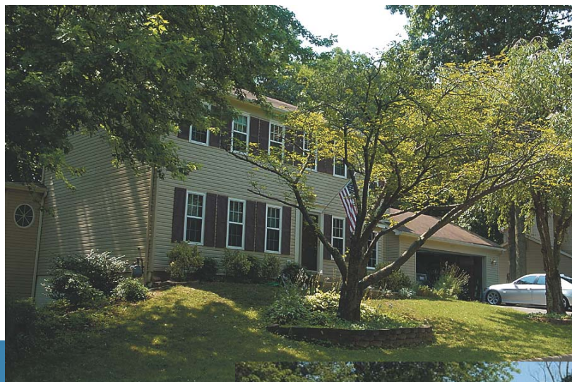
8 5967 Burnside Landing Drive, Burke — $685,000