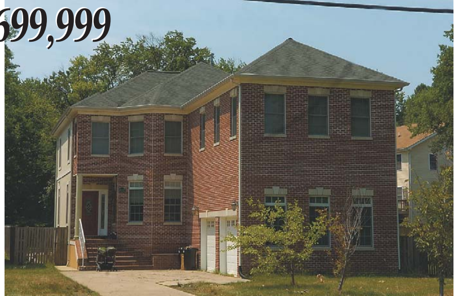
1 10125 Main Street, Fairfax — $699,900