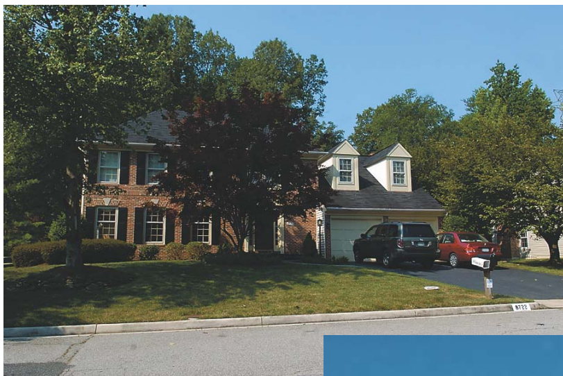
3 8722 Cross Chase Circle, Fairfax Station — $695,000