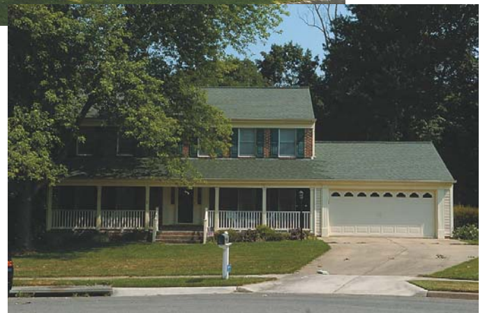
13 9308 Jenna Court, Springfield — $660,000