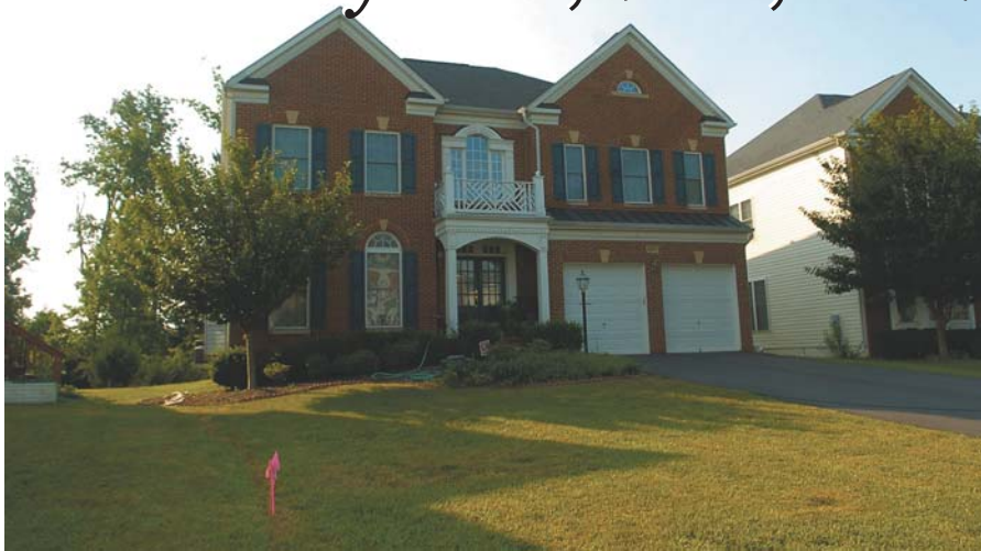
2 13639 Sweet Woodruff Lane, Centreville — $699,000