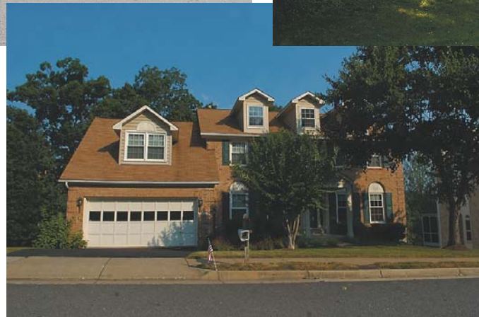
12 13942 Marblestone Drive, Clifton — $660,000