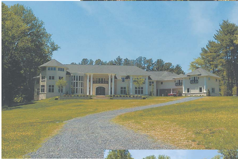
2 814 Leigh Mill Road, Great Falls — $3,900,000