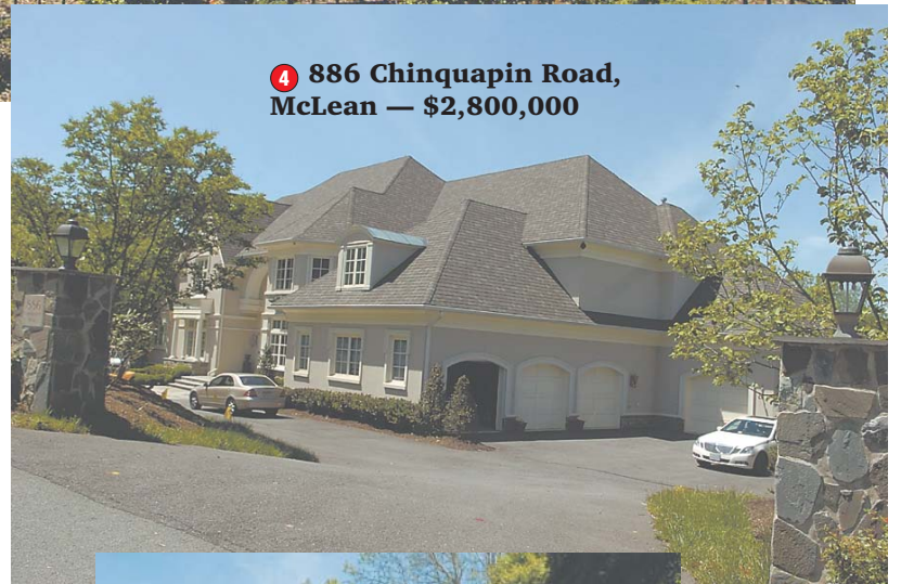
4 886 Chinquapin Road, McLean — $2,800,000