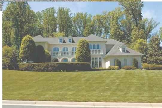
6 922 Dominion Reserve Drive, McLean — $2,600,000