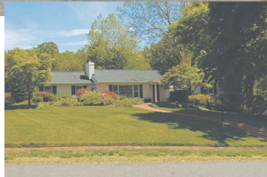
5 6719 Wemberly Way, McLean — $2,795,000