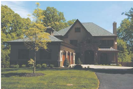
7 2023 Rockingham Street, McLean — $2,500,000