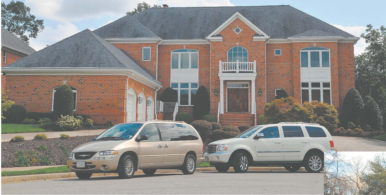
2 9405 Ludgate Drive, Mount Vernon — $1,600,000