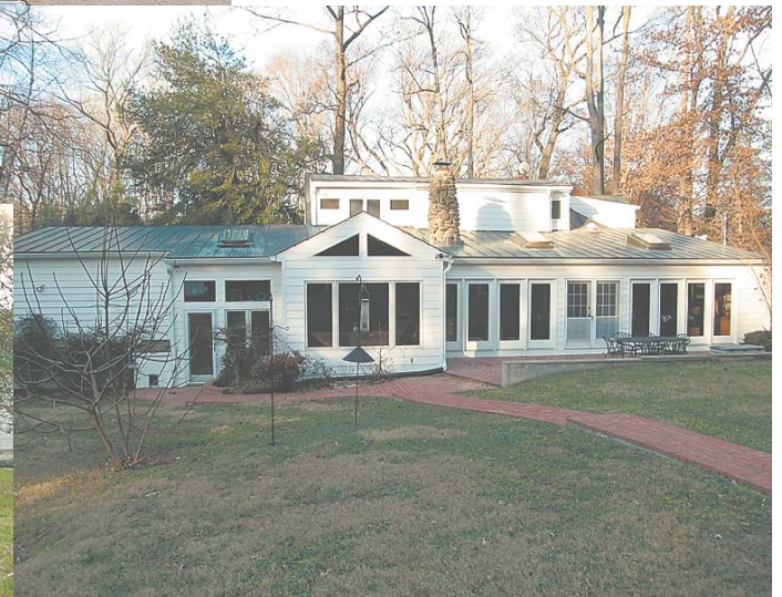
3 825 Arcturus on The Potomac, Mount Vernon — $1,250,000