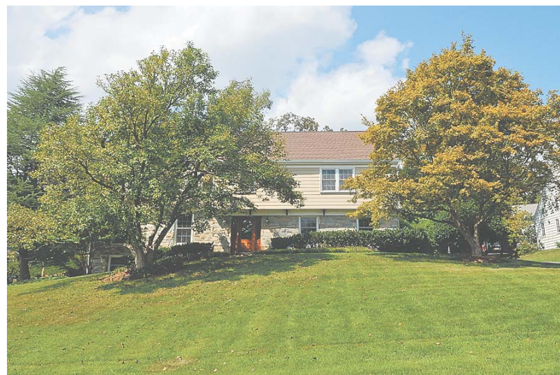
6 2104 Wilkinson Place, Mount Vernon — $1,000,000