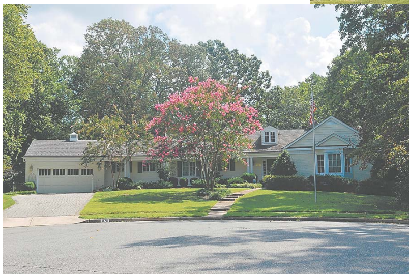
4 8711 Eaglebrook Court, Mount Vernon — $1,198,000