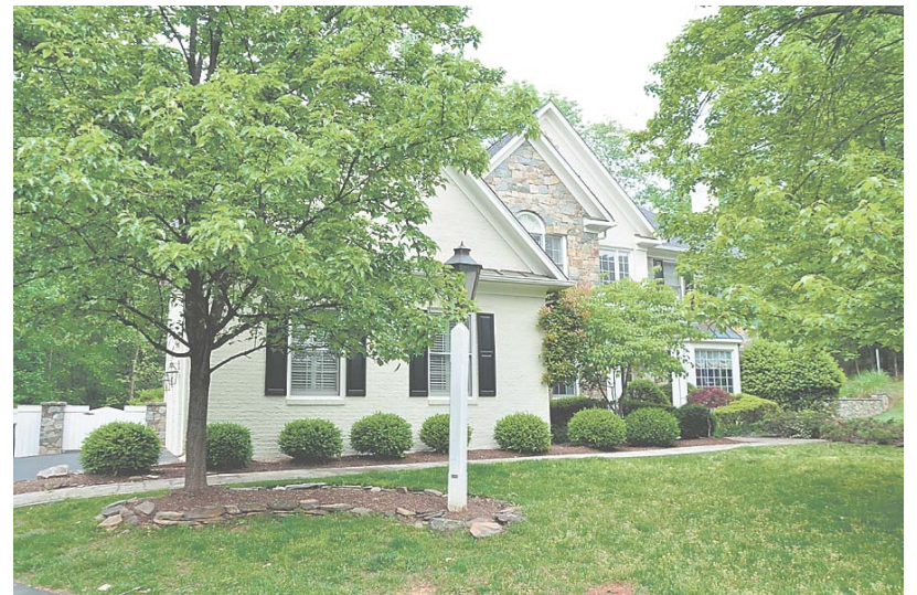
5 10641 MacArthur Boulevard, Potomac — $1,340,000