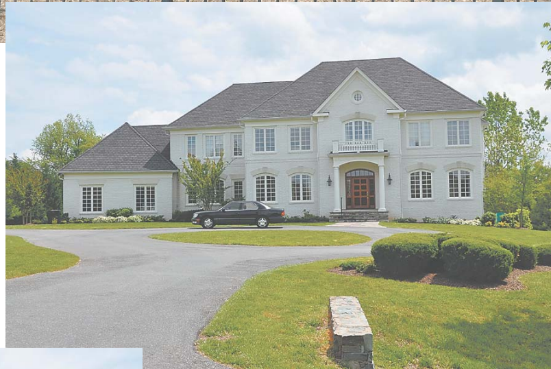
2 10725 Ardnave Place, Potomac — $1,630,000