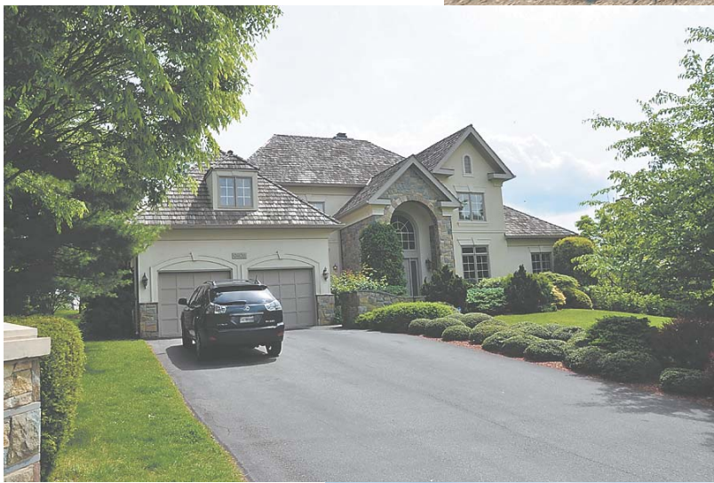
3 9408 Wing Foot Court, Potomac — $1,588,000