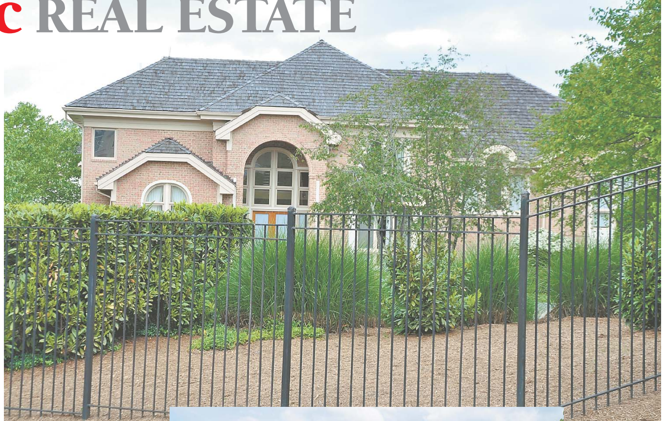
1 9809 Bencross Drive, Potomac — $2,710,000

IN MARCH 2012, 38 POTOMAC HOMES SOLD BETWEEN $2,710,000-$253,000.