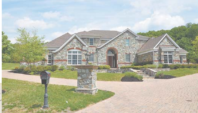
4 10513 Rivers Bend Lane, Potomac — $1,550,000