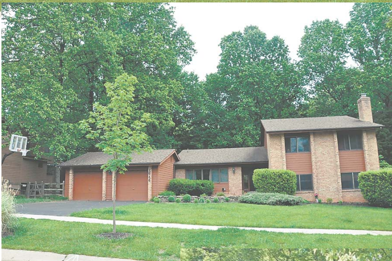
2 2616 Oakenshield Drive, Potomac — $810,000