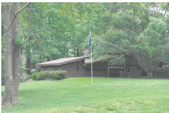
5 10909 Rock Run Drive, Potomac — $750,000