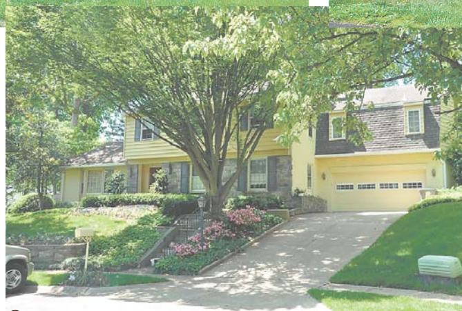
4 8 Harrowgate Court, Potomac — $775,000