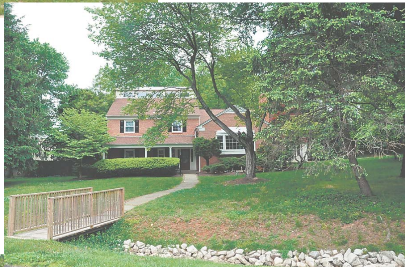
3 10422 Windsor View Drive, Potomac — $800,000