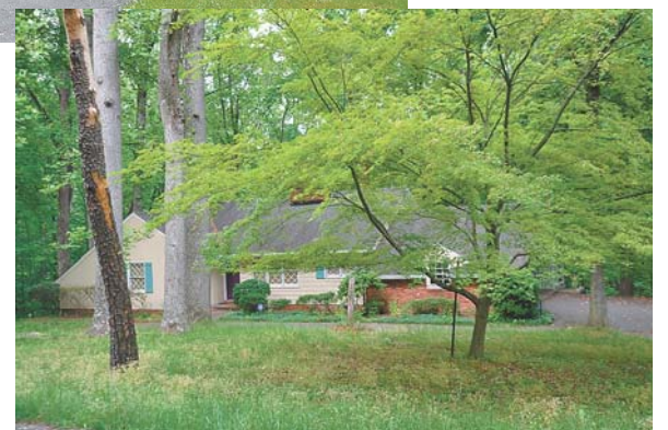
7 11711 Stoney Creek Road, Potomac — $649,000