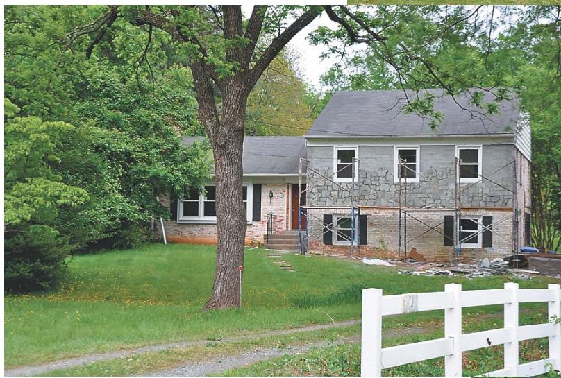
3 9629 Accord Drive, Potomac — $700,000