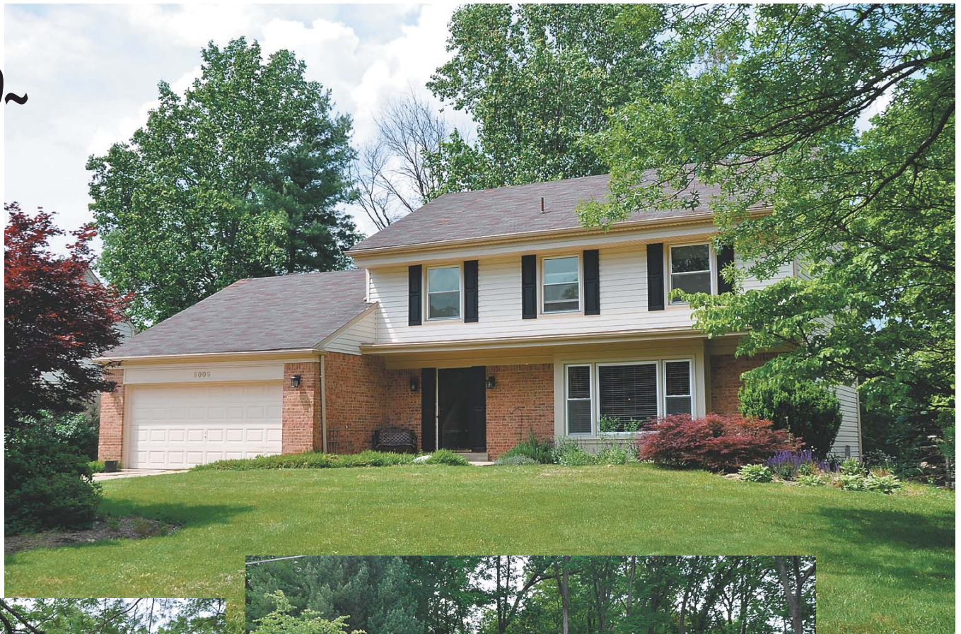
1 9009 Hunting Horn Lane, Potomac — $718,000