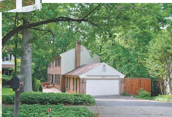
4 1423 Fallswood Drive, Potomac — $690,000