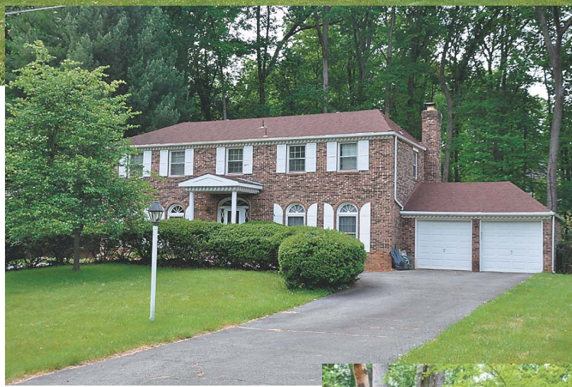
2 11204 Willowbrook Drive, Potomac — $705,000