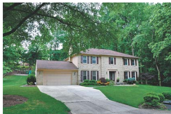
7 11309 Willowbrook Drive, Potomac — $1,001,500