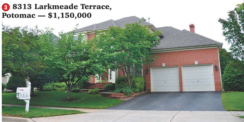
3 8313 Larkmeade Terrace, Potomac — $1,150,000