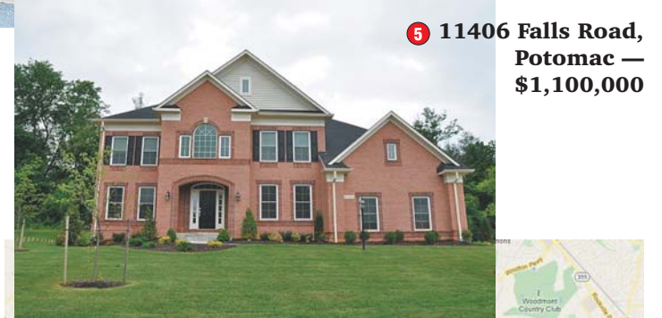
5 11406 Falls Road, Potomac — $1,100,000