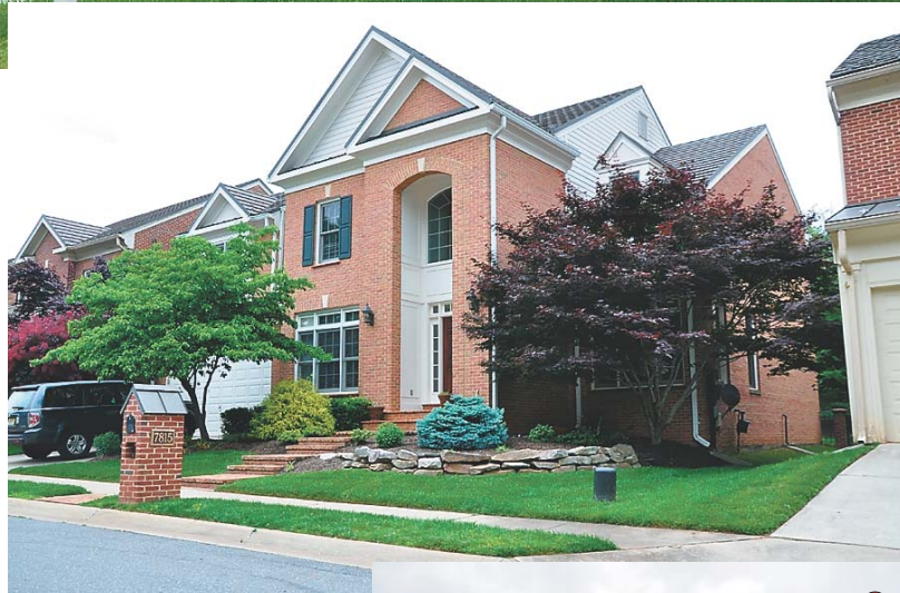
4 7815 Stable Way, Potomac — $1,150,000