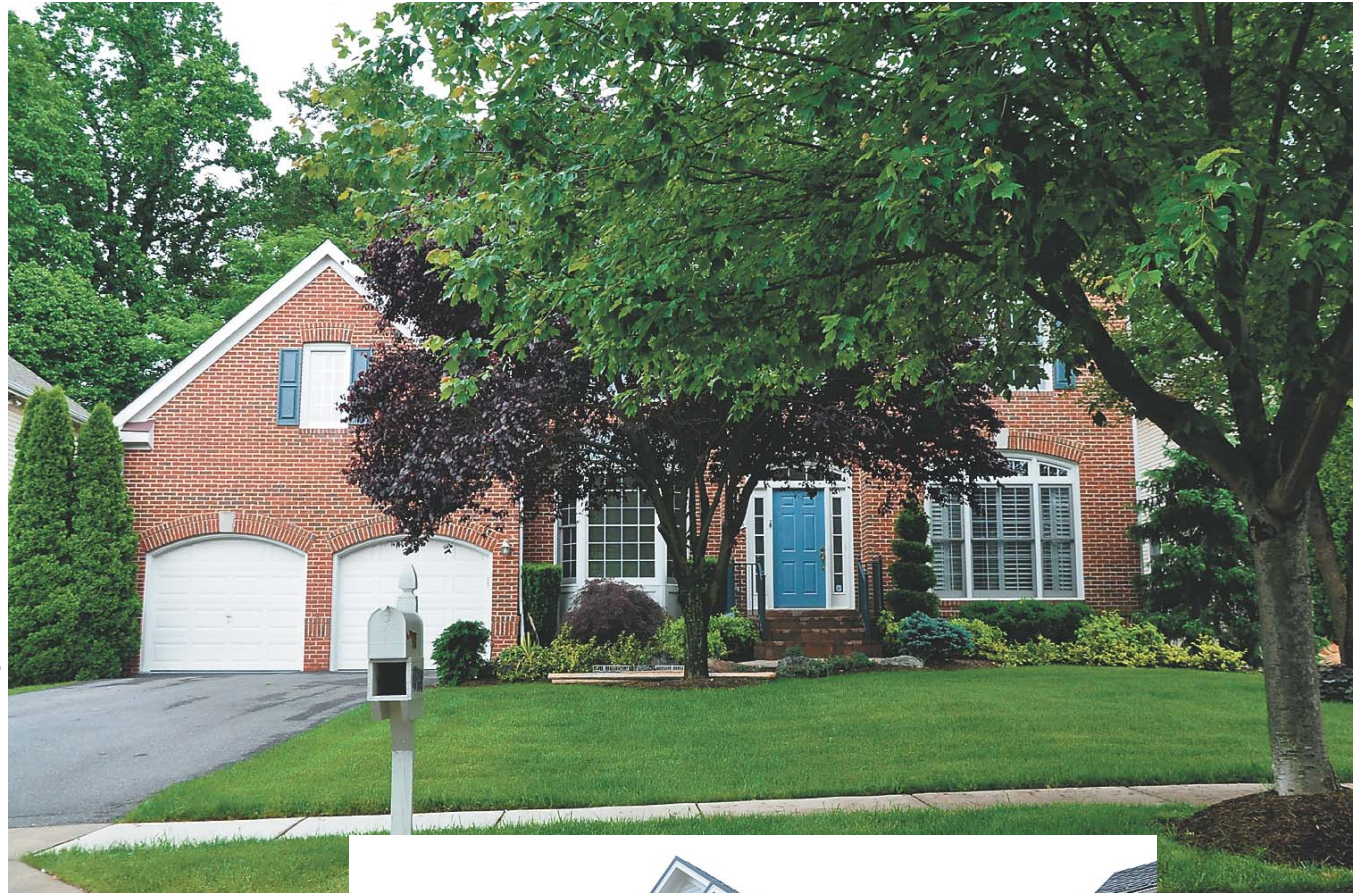
1 10908 Bells Ridge Drive, Potomac — $1,180,000

Sales for April 2012, $1million~ $1.18million