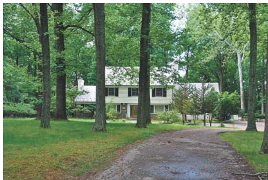
6 10841 Stanmore Drive, Potomac — $1,030,000