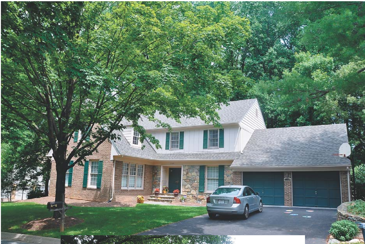
1 11764 Split Tree Circle, Potomac — $895,000