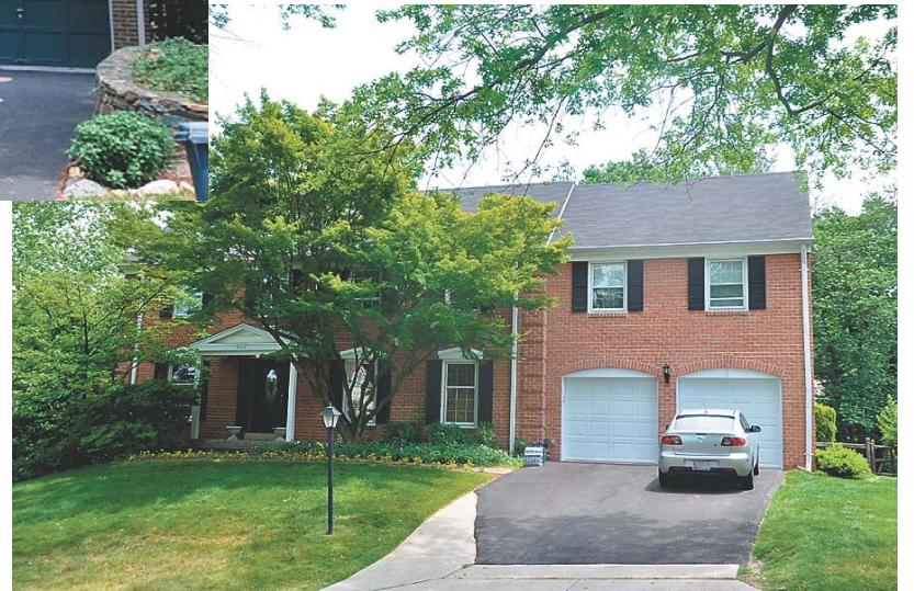
2 9212 Falls Chapel Way, Potomac — $885,000