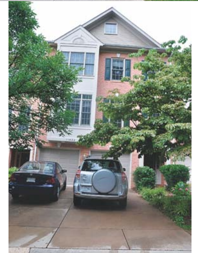
8 11432 Cedar Ridge Drive, Potomac — $810,000