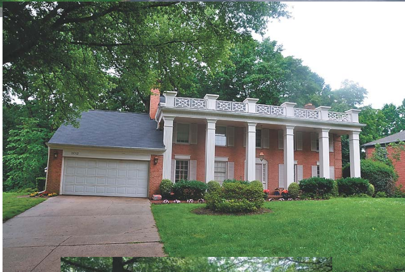
5 11012 Powder Horn Drive, Potomac — $845,000