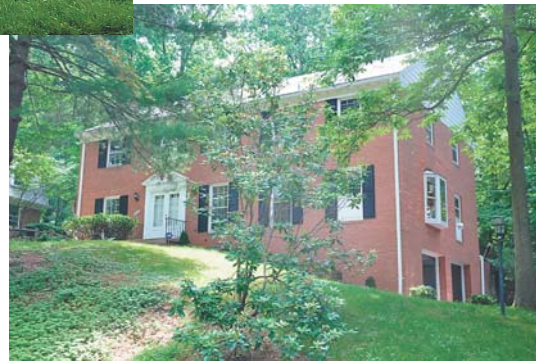
7 12005 Edgepark Court, Potomac — $820,000