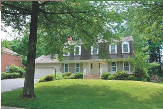
9 8848 Coppenhaver Drive, Potomac — $801,000