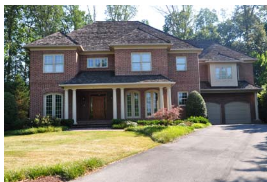
6 8949 Abbey Terrace, Potomac — $1,725,000