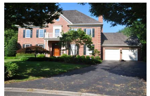
7 9300 Crimson Leaf Terrace, Potomac — $1,500,000