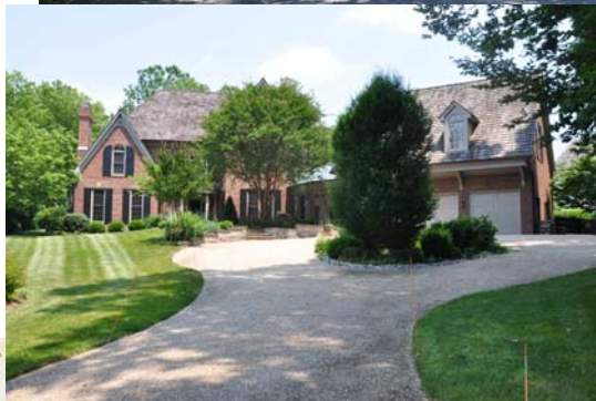
5 11621 Luvie Court, Potomac — $1,750,000