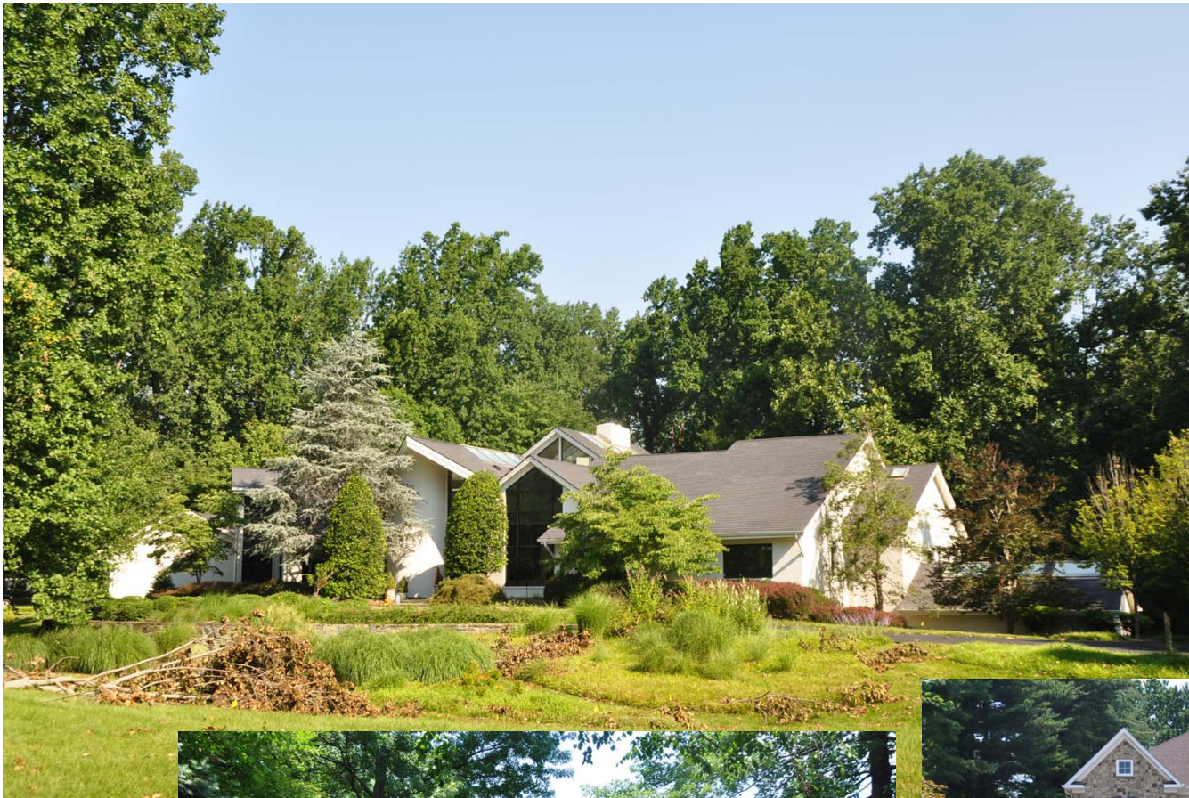
1 9207 Inglewood Drive, Potomac — $2,525,000