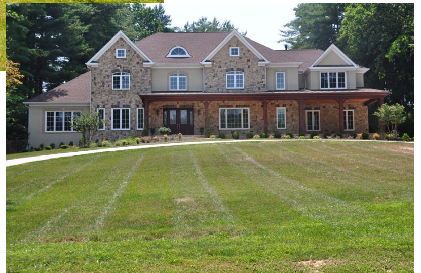
2 11012 Chandler Road, Potomac — $2,400,000