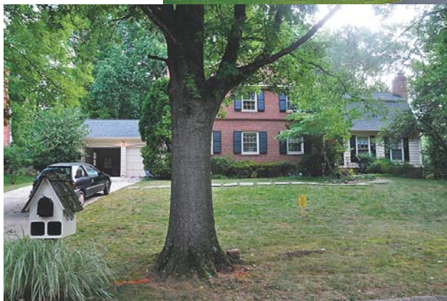
12 10505 MacArthur Boulevard, Potomac — $1,000,000