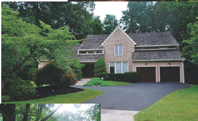
5 9825 Conestoga Way, Potomac — $1,127,000