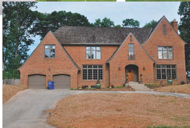
14 10220 Sorrel Avenue, Potomac — $1,000,000