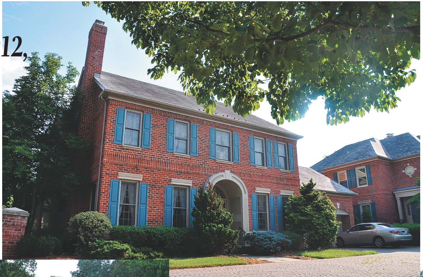
1 9700 Beman Woods Way, Potomac — $1,168,000

Sales in May 2012, $1 million to $1.199 million