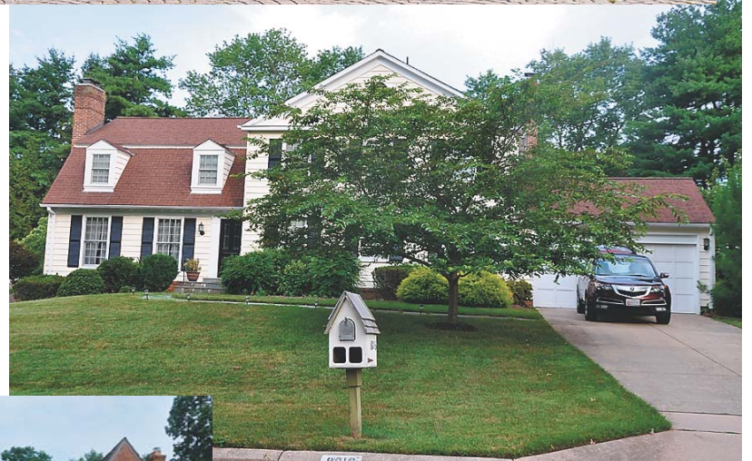
6 8016 Horseshoe Lane, Potomac — $1,100,000