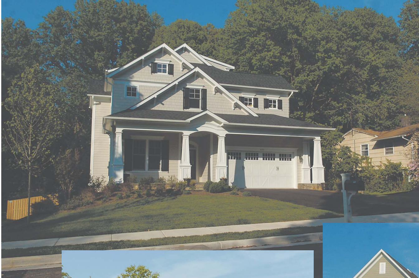
1 353 Park Street Northeast, Vienna — $1,529,000