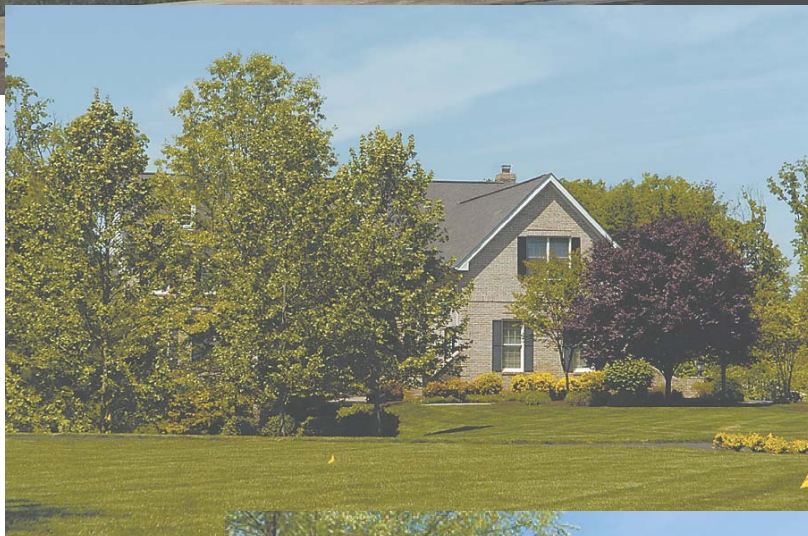
3 3401 Oakton Chase Court, Oak Hill — $1,245,000