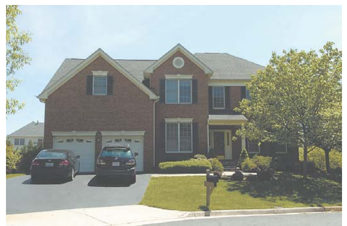
6 2844 Cherry Branch Lane, Herndon — $855,000