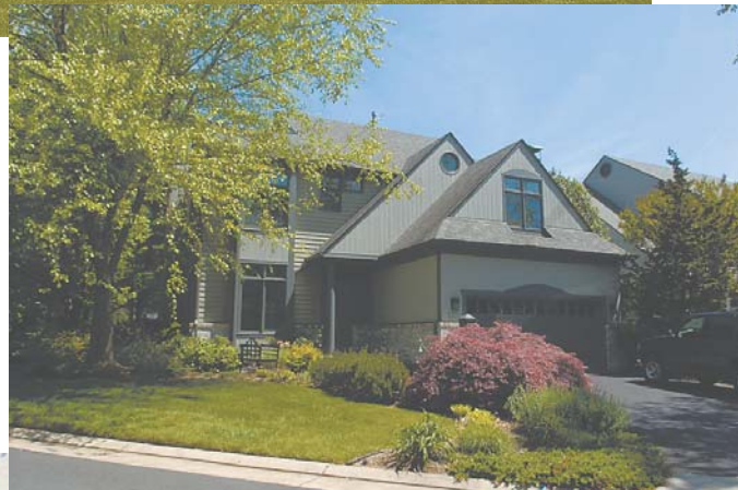
5 1425 Waterfront Road, Reston — $889,000