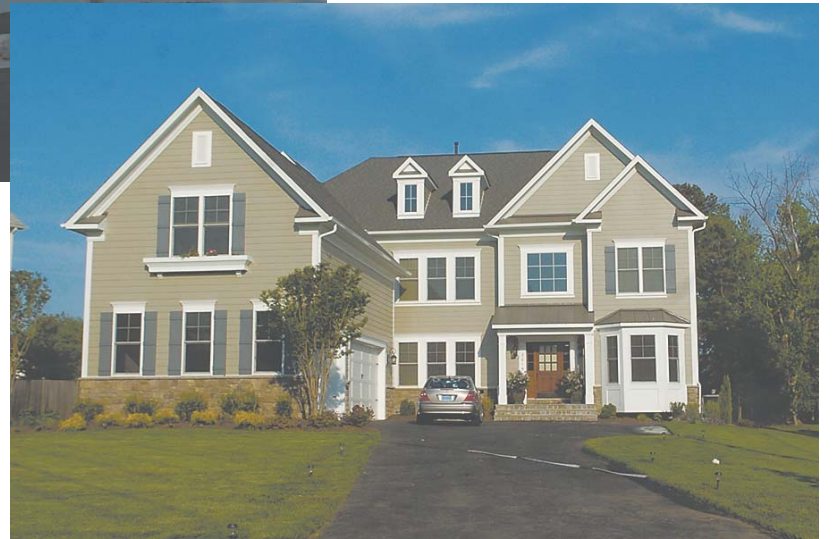
2 2019 George Washington Road, Vienna — $1,406,546