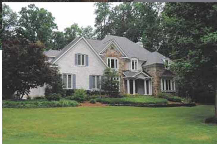
6 10493 Patrician Woods Court, Great Falls — $2,550,000