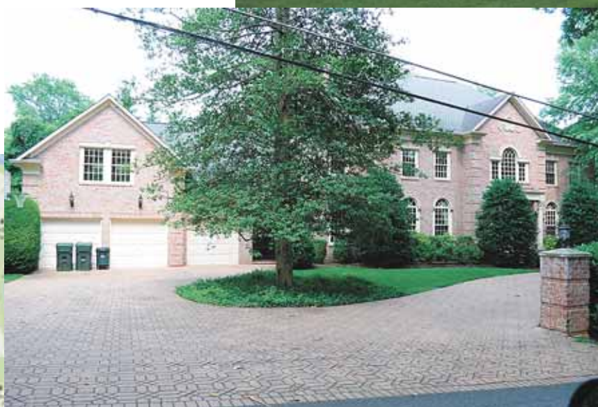
4 1119 Waverly Way, McLean — $2,723,000