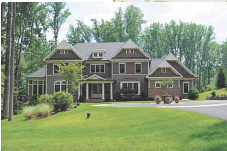
7 9693 Mill Ridge Lane, Great Falls — $2,500,000