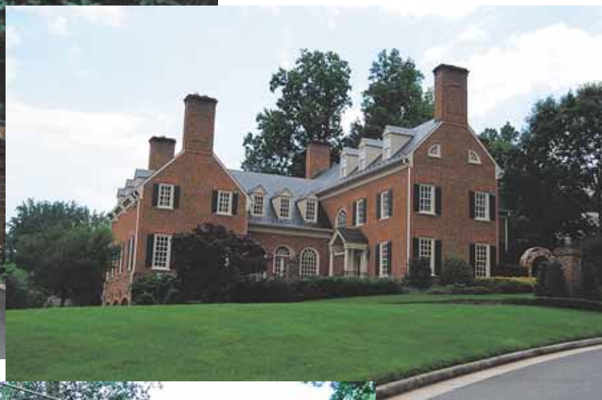
2 1100 Mill Ridge, McLean — $3,104,000