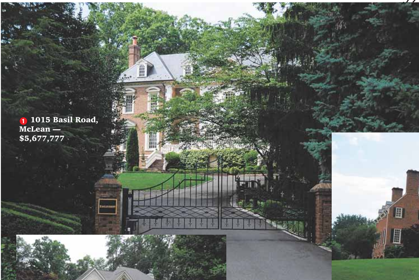
1 1015 Basil Road, McLean — $5,677,777

IN MAY 2013, 31 GREAT FALLS HOMES SOLD BETWEEN $2,840,000-$410,000 AND 132 HOMES SOLD BETWEEN $5,677,777-$127,800 IN MCLEAN.