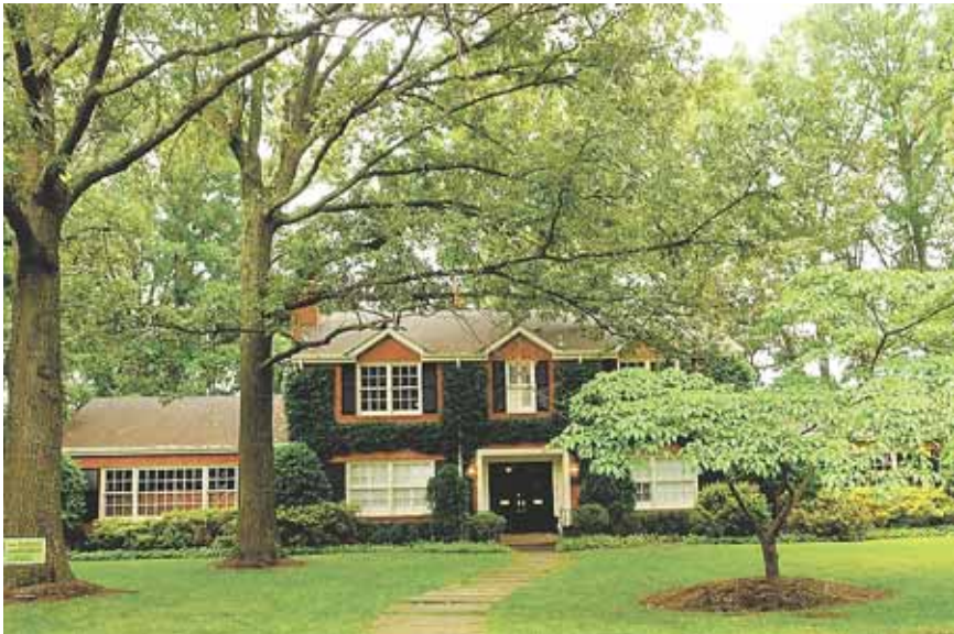
5 1209 Gatewood Drive — $1,106,250