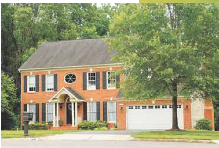
8 2415 Lakeshire Drive — $1,005,000