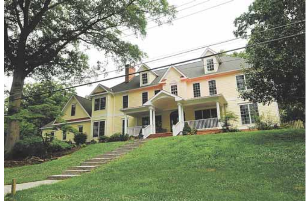
2 1604 River Farm Drive — $1,222,500