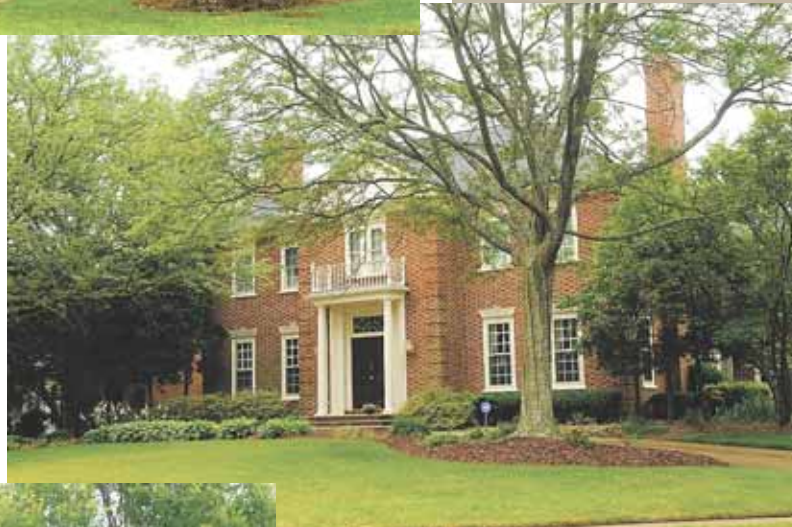
7 9329 Mount Vernon Circle — $1,051,000