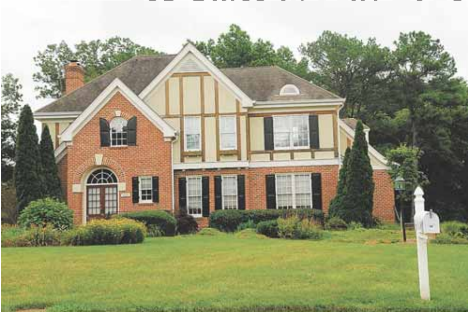
3 9055 Tower House Place — $1,167,500

IN MAY 2013, 157 HOMES SOLD BETWEEN $1,400,000-$65,000 IN THE MOUNT VERNON AREA.