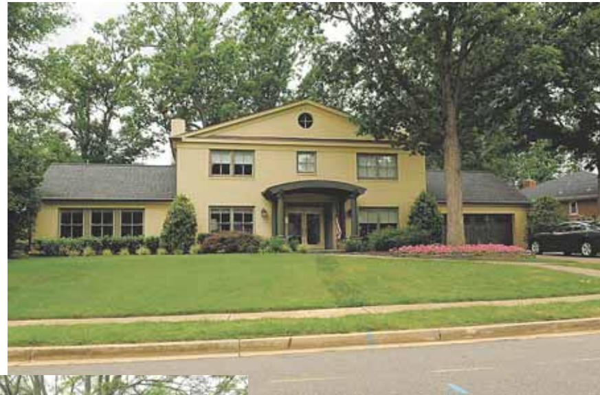
6 7210 Burtonwood Drive — $1,100,000