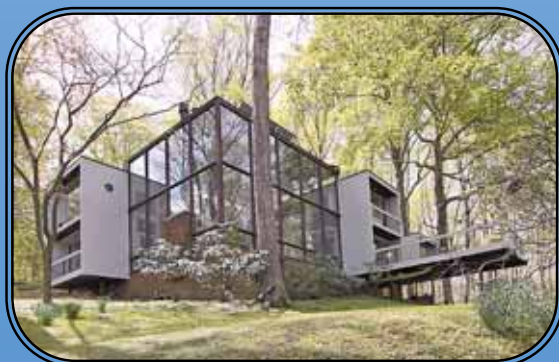
JEFFERSON RUN RD, GREAT FALLS $1,900,000