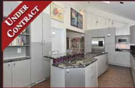
11124 Rich Meadow Dr., Great Falls $1,099,000