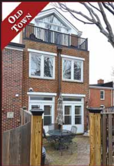
805 Wolfe St., Alexandria $1,249,000