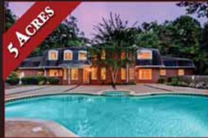
720 Clear Spring Rd., Great Falls $1,399,000