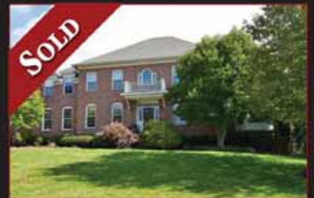
1195 Lees Meadow Ct., Great Falls $1,500,000