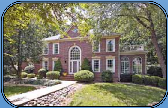
BOWEN, GREAT FALLS $1,049,000