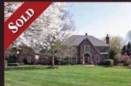
505 Seneca Knoll Ct., Great Falls $1,422,500