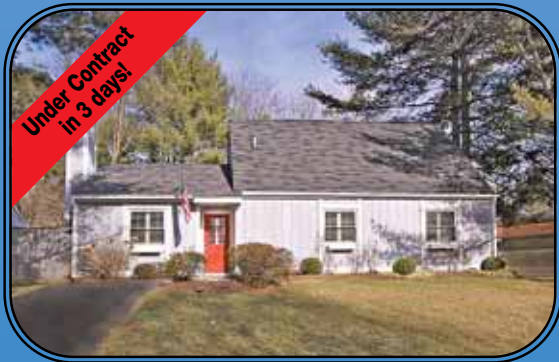
GREAT MEADOW DR, RESTON $510,000