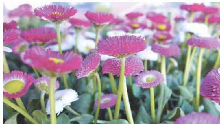
English daisies add bright bursts of color to spring gardens.