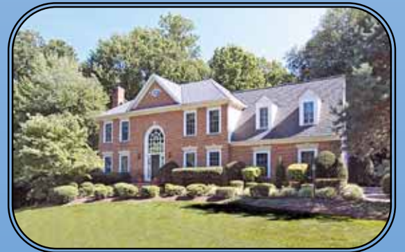
MCCUE CT, GREAT FALLS $1,225,000