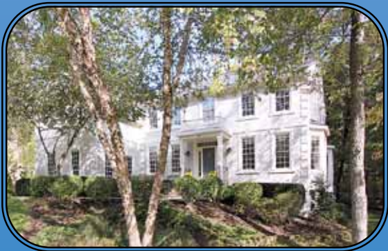
SHERLIN LN, GREAT FALLS $1,150,000