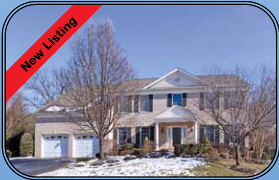
AUTUMN CREST, OAK HILL $965,000