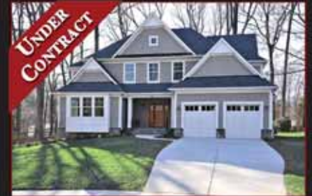
1121 Kelley St., Vienna $1,399,000