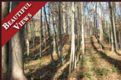
Springvale Rd., Great Falls 3.48 Acre Lot $680,000