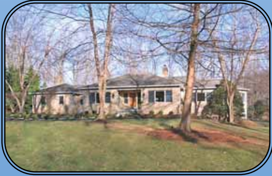
GOULDMAN LN, GREAT FALLS $1,675,000