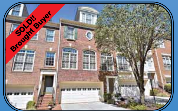
CARRIAGE HILLS DR, MCLEAN $830,000