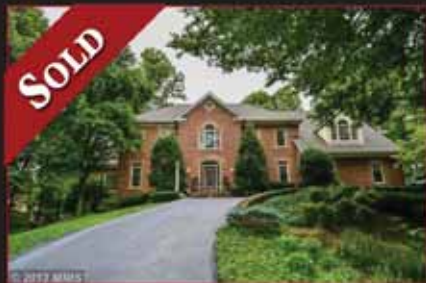
501 Seneca Knoll Ct., Great Falls $1,587,000