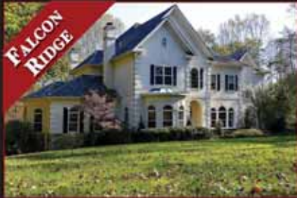
10100 Harewood Ct., Great Falls $1,799,000