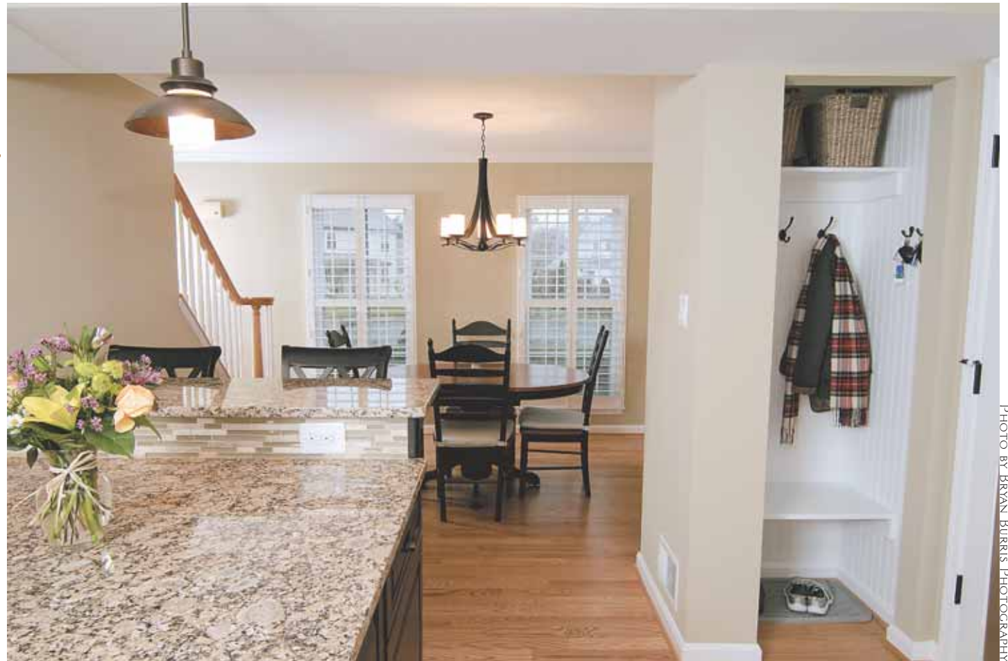
By borrowing a mere nine square feet from the dining room, the designers found space for a small mudroom with bench immediately to the right of a side kitchen door.

At just over 800 square feet, the home's primary living area had been serviceable enough; even so, the formal dining room and adjacent den on opposite sides of the front facing foyer were hardly ever used and the rear family room was dark and cramped.