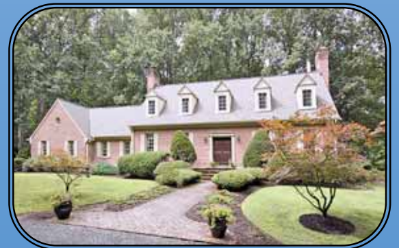
SPRINGVALE RD, GREAT FALLS $1,499,000