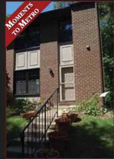
2040 Headlands Circle, Reston $469,000