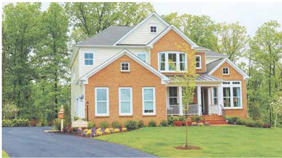
VAN METRE DESIGN STUDIO

The Van Metre Portsmouth Model at Brambleton includes 3,692 square feet with five bedrooms and three baths with a main level bedroom and full bath. Van Metre homes operates an award-winning new homes design center at 24600 Mill Stream Drive #400, Stone Ridge, VA 20105.