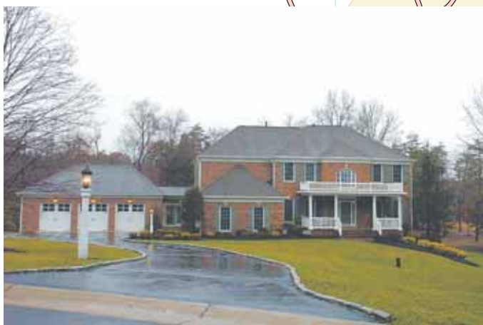
9 16700 Cedar Post Court, Centreville — $1,045,000