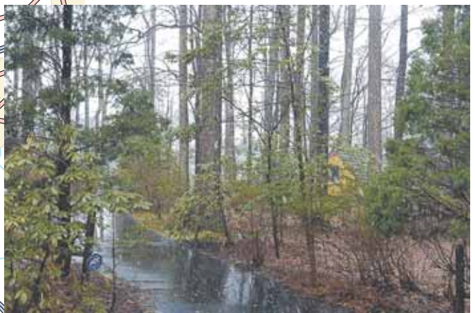
6 11418 Liltling Lane, Fairfax Station — $1,165,000