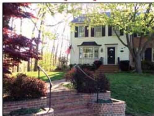
Springfield • $525,000 • Premium Golf Course Lot • .23 Acres