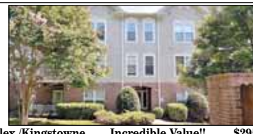
Alex/Kingstowne Incredible Value!! $295,000

in sought-after South Run Crossing! This 3-Level Beauty features a magnificent sunroom addition, plus updates/upgrades galore: fresh paint throughout, new carpet throughout, hardwoods, granite & more! Unbeatable location... just 1 light to the Fairfax County Parkway, and a quick hop to Franconia/Springfield Metro, 95/495, and area amenities.