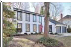
Springfield $634,900 $25K Price Improvement! Don't miss this sensational Van Metre-built 4 BR, 2 Full, 2 Half-Bath Colonial tucked on a private, wooded lot

in sought-after South Run Crossing! This 3-Level Beauty features a magnificent sunroom addition, plus updates/upgrades galore: fresh paint throughout, new carpet throughout, hardwoods, granite & more! Unbeatable location... just 1 light to the Fairfax County Parkway, and a quick hop to Franconia/Springfield Metro, 95/495, and area amenities.