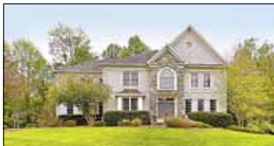
Clifton - $1,195,000