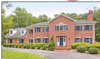
Fairfax Station - $1,200,000

Gorgeous all brick custom home on 5 beautiful acres, in a lovely community, is an oasis w/ beautiful landscaping, pool & patio.