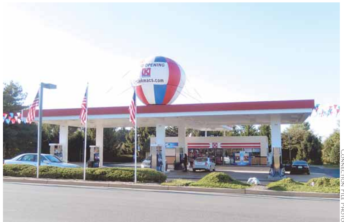
The Centre Ridge Exxon's owner plans to sell hot dogs and alcohol in his station's convenience store.