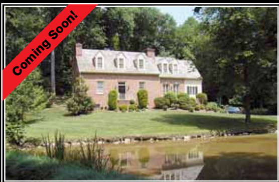
COLVIN ROAD, GREAT FALLS