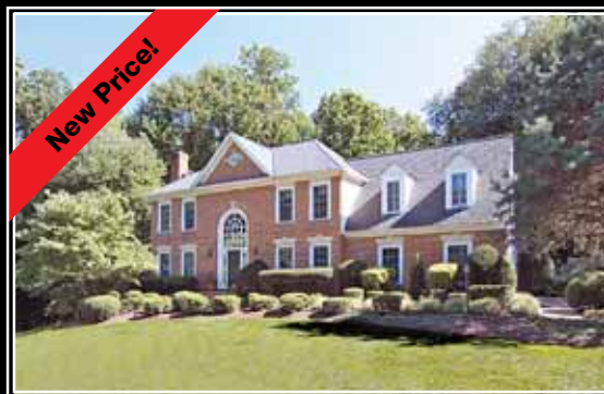
MCCUE CT GREAT FALLS $1,075,000