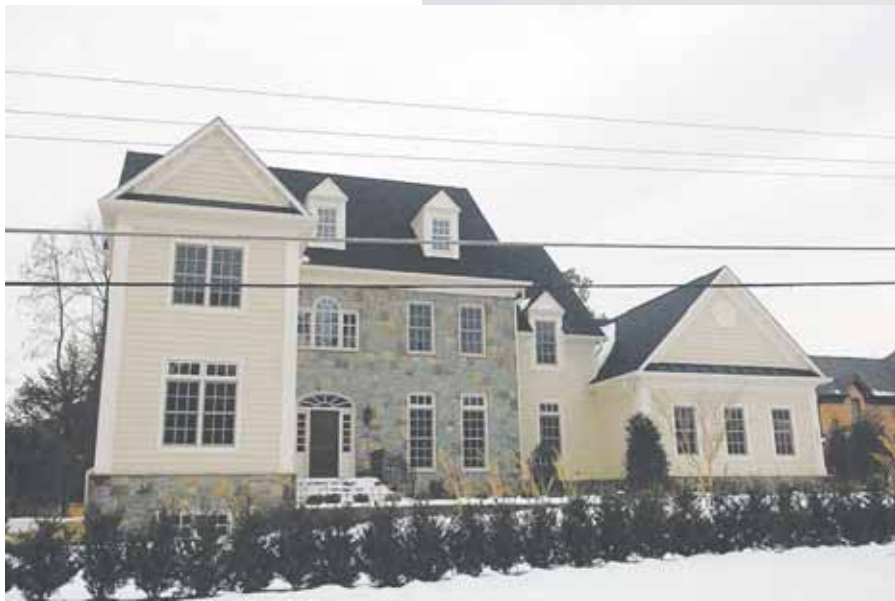
2 6609 Brawner Street, McLean — $2,575,000