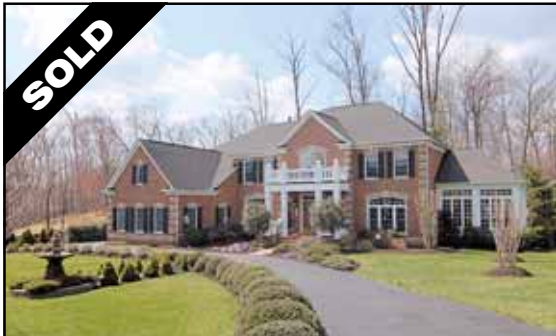
Great Falls $1,850,000