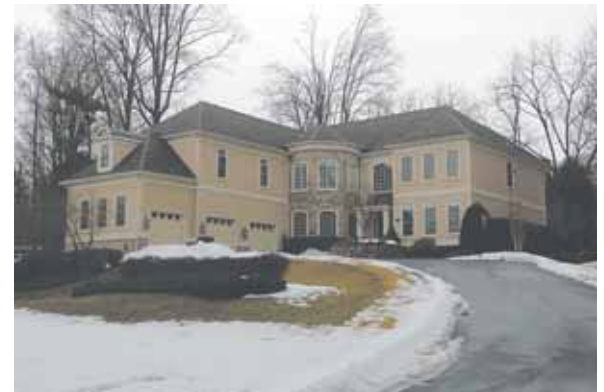
7 1040 Bellview Road, McLean — $1,928,000