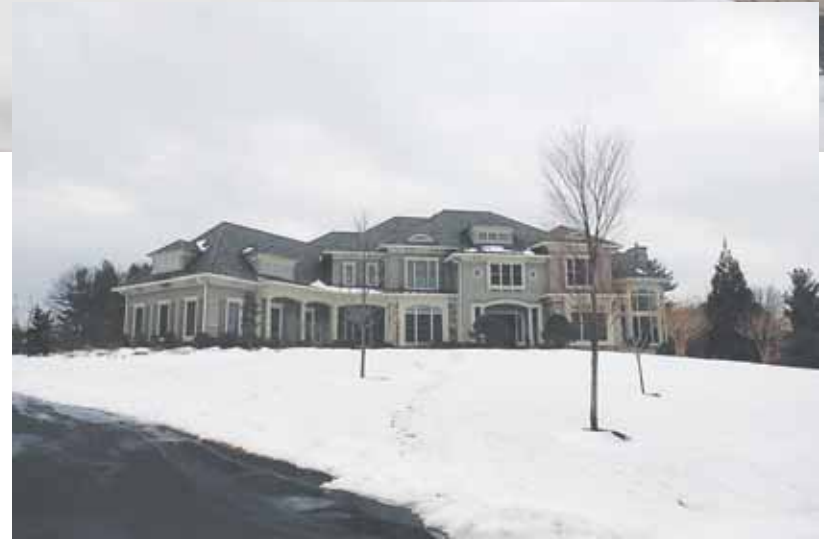
3 859 Nicholas Run Drive, Great Falls — $2,550,000