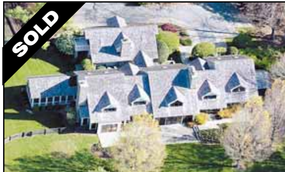
Great Falls $2,250,000