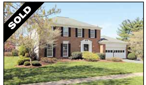
Great Falls $839,900