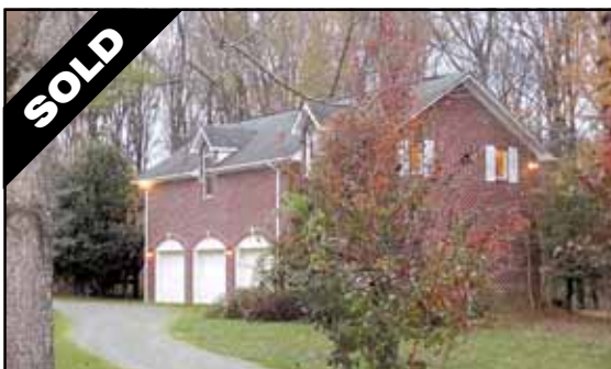
Great Falls $725,000