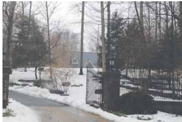
6 8718 Woodside Court, McLean — $1,995,000