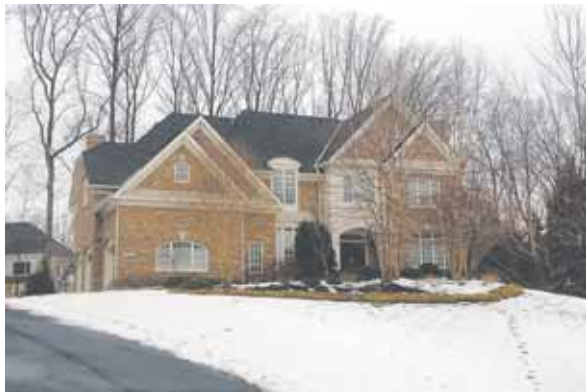
5 952 Dominion Reserve Drive, McLean — $2,350,000