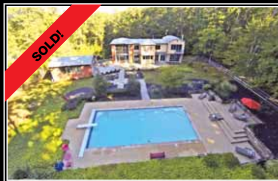
ALLENWOOD LANE, GREAT FALLS $1,449,000