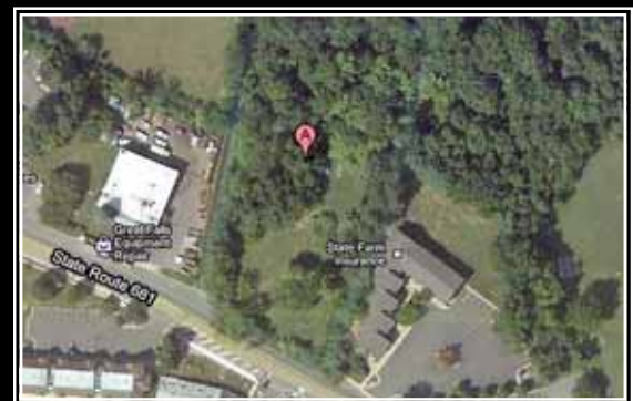
WALKER ROAD, GREAT FALLS $2,650,000

LONG & FOSTER REAL ESTATE, INC. 9841 GEORGETOWN PIKE P.O. Box 97 GREAT FALLS, VA 22066 703-759-9190