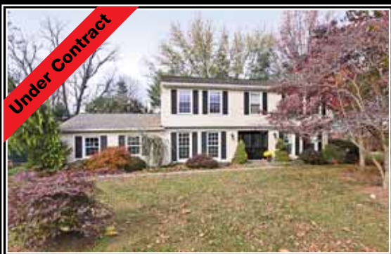
BRANDENBURG, GREAT FALLS $929,000