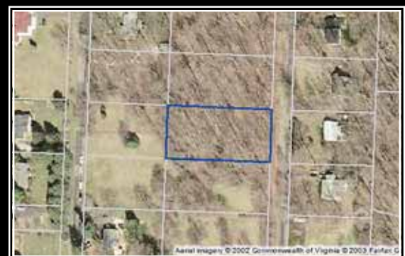
720 ELLSWORTH, GREAT FALLS $675,000