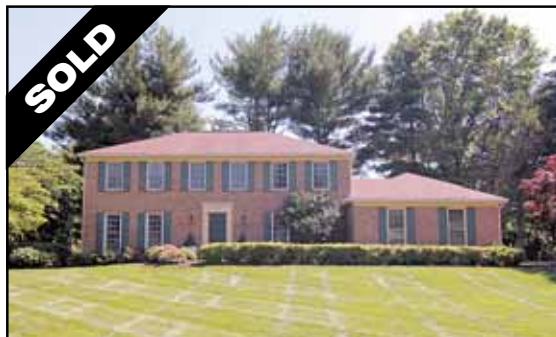
Great Falls $925,000