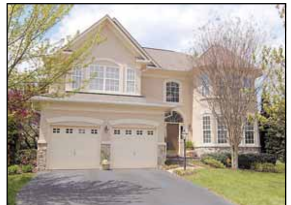
Potomac Falls $699,000

Magnificent estate home on nearly 4 acres in wonderful "Beacon Hill!" Best lot in the community with spectacular views & vistas. Dramatic open floorplan with upgrades & custom features throughout. 5 Bedrooms, 4 Full Bathrooms & 2 Half Bathrooms. 2-story Family Room, Solarium, Main-Level Library, 5 Fireplaces. Incredible walkout lower "Game Level" with full Bar, Billiards, Media Area, Exercise Room, 5th Bedroom & full Bathroom. Beautiful pool & spa overlooking private backyard. An entertainer's dream!