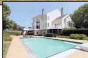
Leesburg $1,399,000 The Best of "Beacon Hill"...

Magnificent estate home on nearly 4 acres in wonderful "Beacon Hill!" Best lot in the community with spectacular views & vistas. Dramatic open floorplan with upgrades & custom features throughout. 5 Bedrooms, 4 Full Bathrooms & 2 Half Bathrooms. 2-story Family Room, Solarium, Main-Level Library, 5 Fireplaces. Incredible walkout lower "Game Level" with full Bar, Billiards, Media Area, Exercise Room, 5th Bedroom & full Bathroom. Beautiful pool & spa overlooking private backyard. An entertainer's dream!