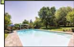
Great Falls $1,995,000 Extraordinary Custom Estate... with Attached Guest House!

Grand "Main House" with attached 2 Bedroom / 2 Bathroom "Guest House"—offering a total of over 10K finished square feet. Impeccable all-brick construction featuring dramatic architecture & exquisite finishes—including 2-story double staircase Foyer, 2-story Family Room, Gourmet "French County" Kitchen, sun-lit walkout Lower Level, 7 Fireplaces, 4-car Garage... and so much more! Total of 6 Bedrooms, 7 Full Bathrooms & 2 Half Bathrooms. Located on picturesque 2.64 acres—boasting a lavish oversized pool with flagstone surround. Langley High School district. The home of a Lifetime!