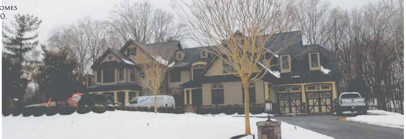
1 214 River Park Drive, Great Falls — $2,875,000

IN DECEMBER 2014, 9 GREAT FALLS HOMES SOLD BETWEEN $2,875,000-$675,000. AND 52 HOMES SOLD BETWEEN $2,575,000-$210,000 IN THE MCLEAN AND FALLS CHURCH AREA.