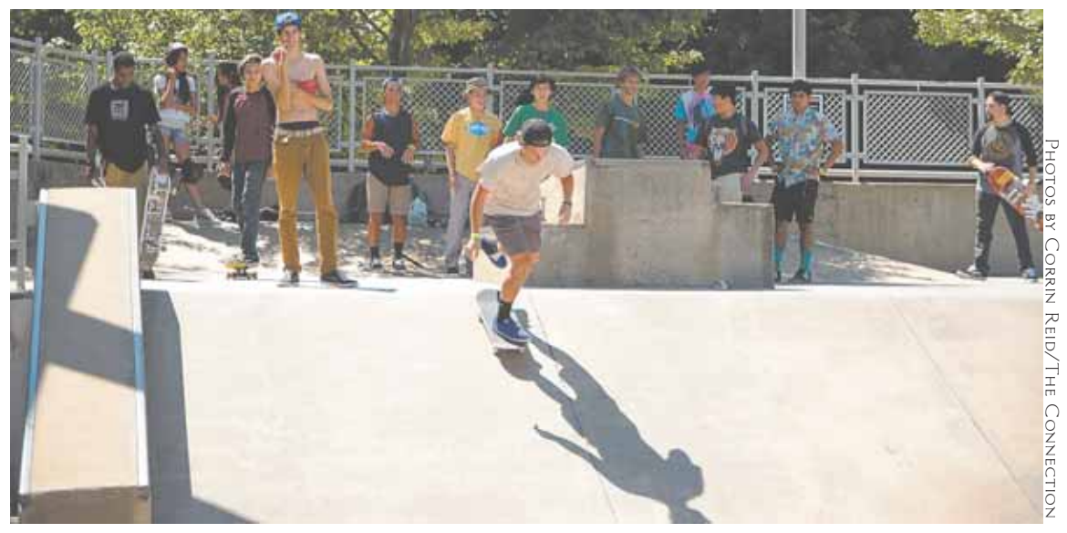
A skateboarder takes off at the Caked Out Skateboard and Music Fest was held Saturday, Aug. 15 at Powhatan Springs Skateboard Park.