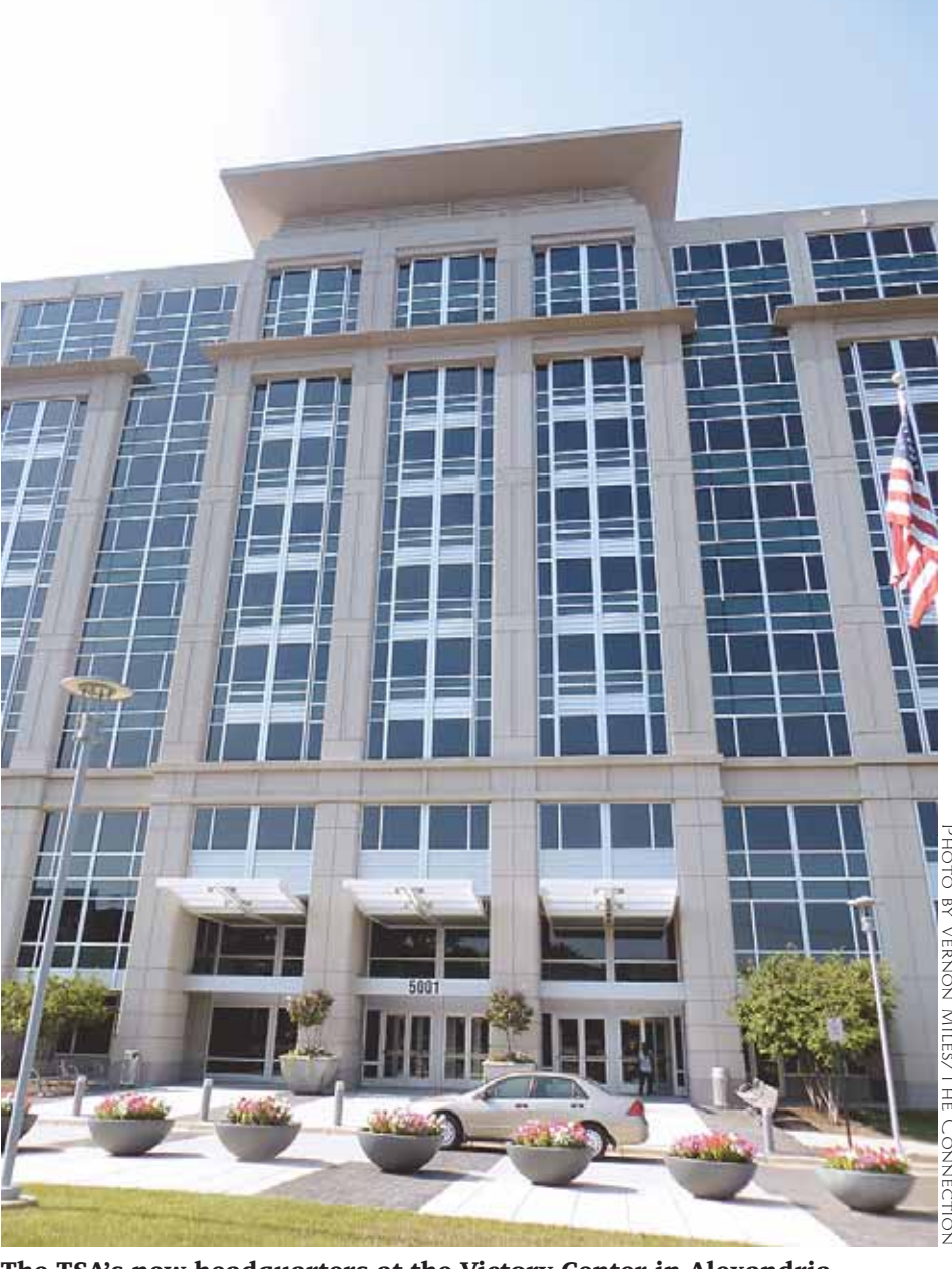
The TSA's new headquarters at the Victory Center in Alexandria.