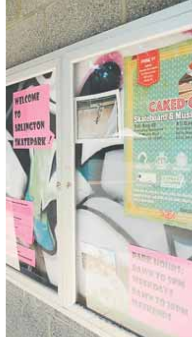
Announcement of the Caked Out Skateboard and Music Fest is displayed on the Arlington County park announcement/welcome board. The skateboard park is located directly off of Wilson Boulevard and is constructed for beginners to experienced riders.