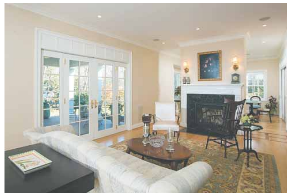
The split-level’s former bow window was converted to a set of French doors which overlook the new veranda. Though the execution makes the addition hard to detect, the dining room beyond the fireplace is actually in the home’s new wing.

“The structural challenge was finding an optimal way to raise the front door to the main level of the house,” Gallagher said.