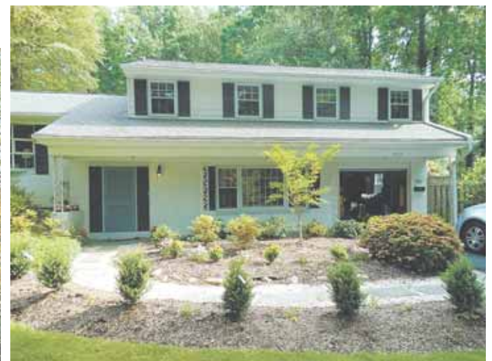
BEFORE: Above, owners Jack and Marie Torre wanted square footage for a larger kitchen and dining room, but “set-back” rules prohibited building in the rear, and the front-facing roof overhang limited options for re-designing the facade.