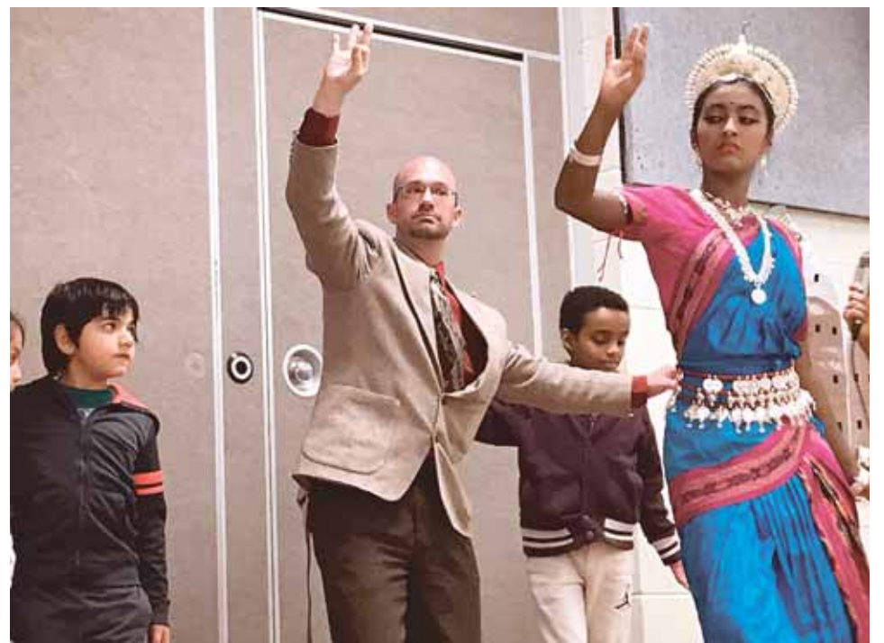
Audience participation and active learning: after removing their shoes, more than 30 boys, girls and even staff and parents stepped onto the stage.