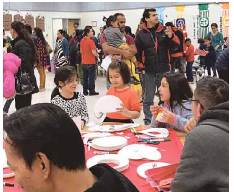
Crowds of parents, grandparents and children from different nationalities arrived for International Night at Hutchison Elementary in Herndon. The free event was produced by Hutchison School staff, supported by volunteers and sponsored by Arts Herndon.