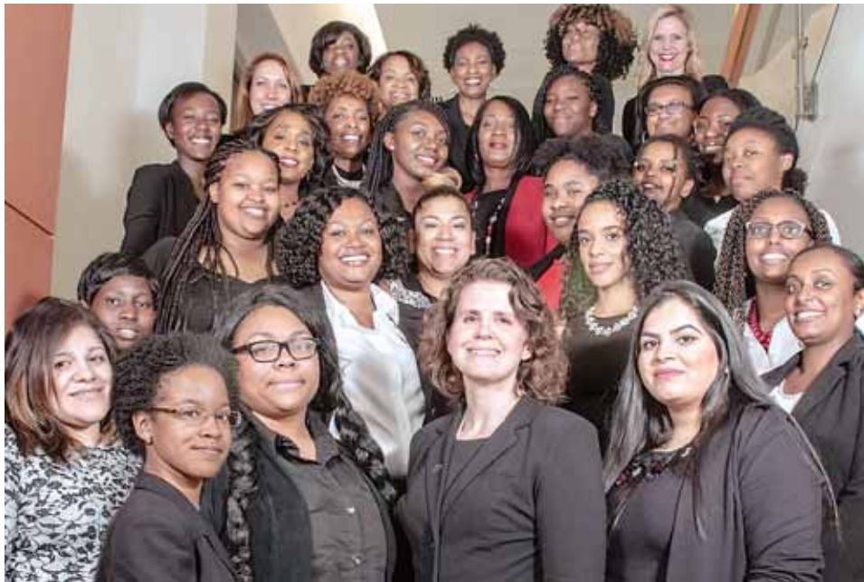
The Women in Search of Excellence (WISE) Mentoring Program run by Northern Virginia Community College is designed to address challenges faced by young women in higher education.