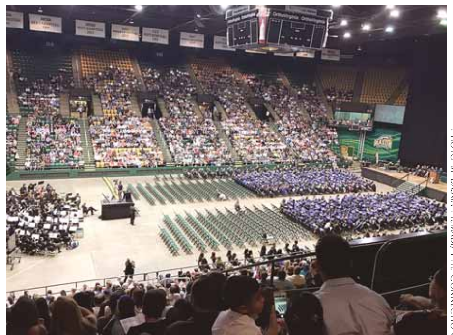
Friends and family join together at Eagle Bank Arena to celebrate the achievements of Thomas A. Edison High School seniors.