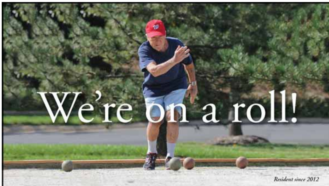
Resident since 2012

For further information, see www.arlingtondiocese.org