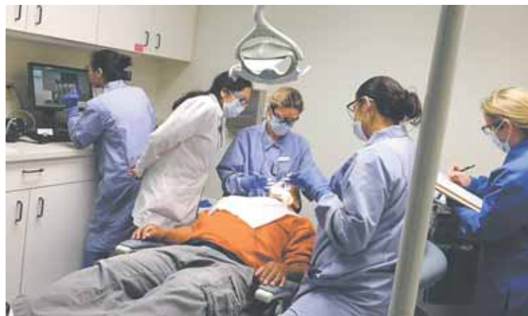
A Lamb Center guest receiving a dental exam at the free, onsite clinic.