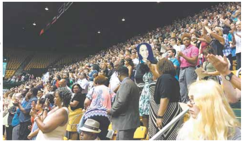
Friends and family of graduates cheer as the ceremony begins.