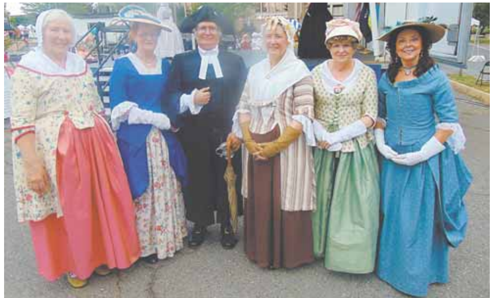
A group of models show off 18th century attire during the Fairfax Fashion Through the Years fashion show at the county's 275th Anniversary celebration.