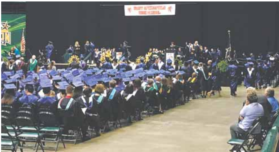
Students walk across the stage to receive their diplomas.

Shortly after Baird’s speech ended, the class of 2017 made their way across the stage one by one as families all over the arena could be heard cheering when their child’s name was called. Once all the diplomas were handed out, these Spartans stood together one last time to turn their tassels and fill the arena with flying blue caps.