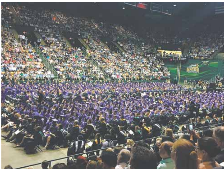
More than 700 Lake Braddock seniors graduate together in the Eaglebank arena.