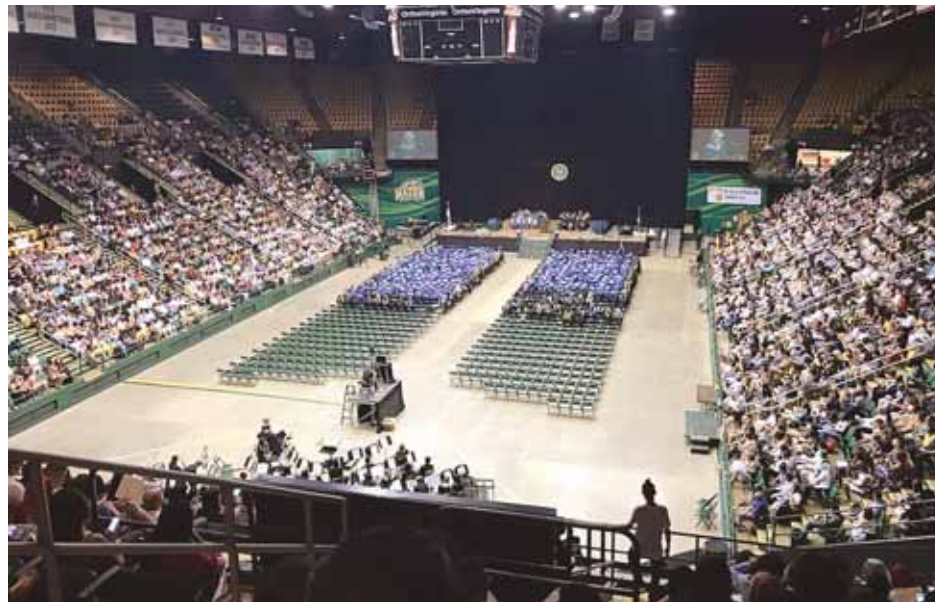
The stands at Eagle Bank filled up fast as family and friends joined to support the Lee High School’s graduating class.

Lee, which is an International Baccalaureate (IB) school, had 28 IB candidates graduating this school year. The rigorous program requires students to take majority IB courses, a Theory of Knowledge (TOK) course, write a 4,000-word “ex-