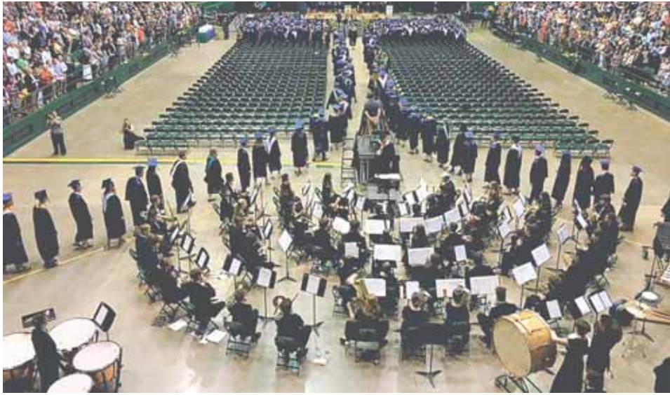
Students process into the arena floor to take their seats.