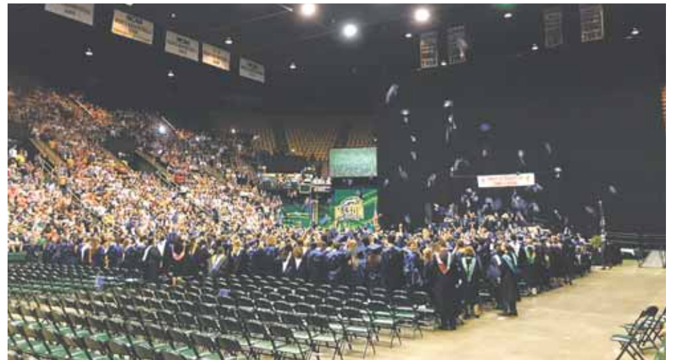
The now graduated Spartans throw their caps into the air.