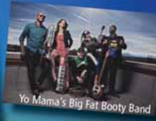
Yo Mama's Big Fat Booty Band