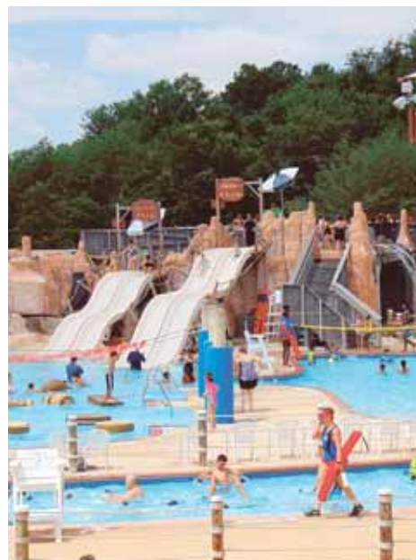
Swimmers enjoy the Water Mine Family Swimmin' Hole at Lake Fairfax in Reston on Saturday, July 1.