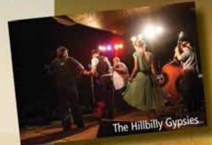
The Hillbilly Gypsies

Bring this ad to qualify for a concert t-shirt giveaway.