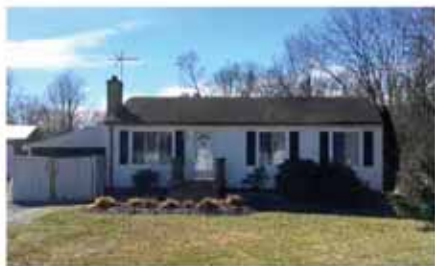
353 WEST VIRGINIA AVE, HAMILTON • $299,900

This is a great opportunity for a first time home buyer or investor. 3 bedroom detached home, one level ranch-style living, eat in kitchen, wall to wall carpet, wood stove, back deck, patio, and large outbuilding. Large fenced-in back yard. Roof replaced June 2017.