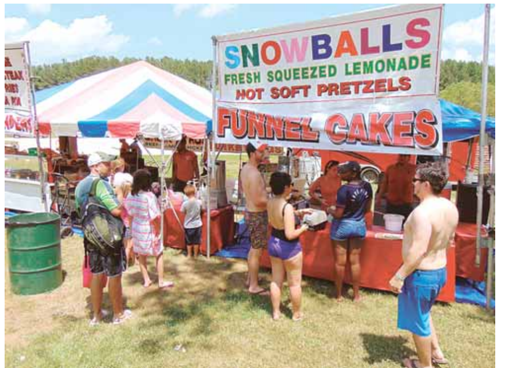
People try cooling off with snow cones from the Snowballs Concession stand.