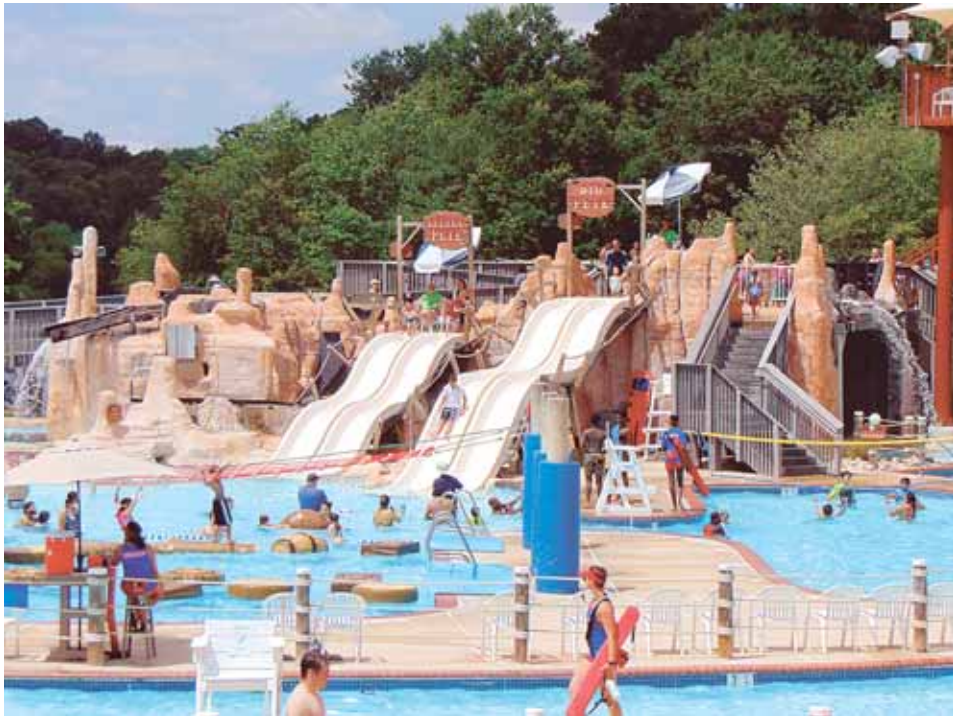
Swimmers enjoy the Water Mine Family Swimmin' Hole at Lake Fairfax in Reston on Saturday, July 1.