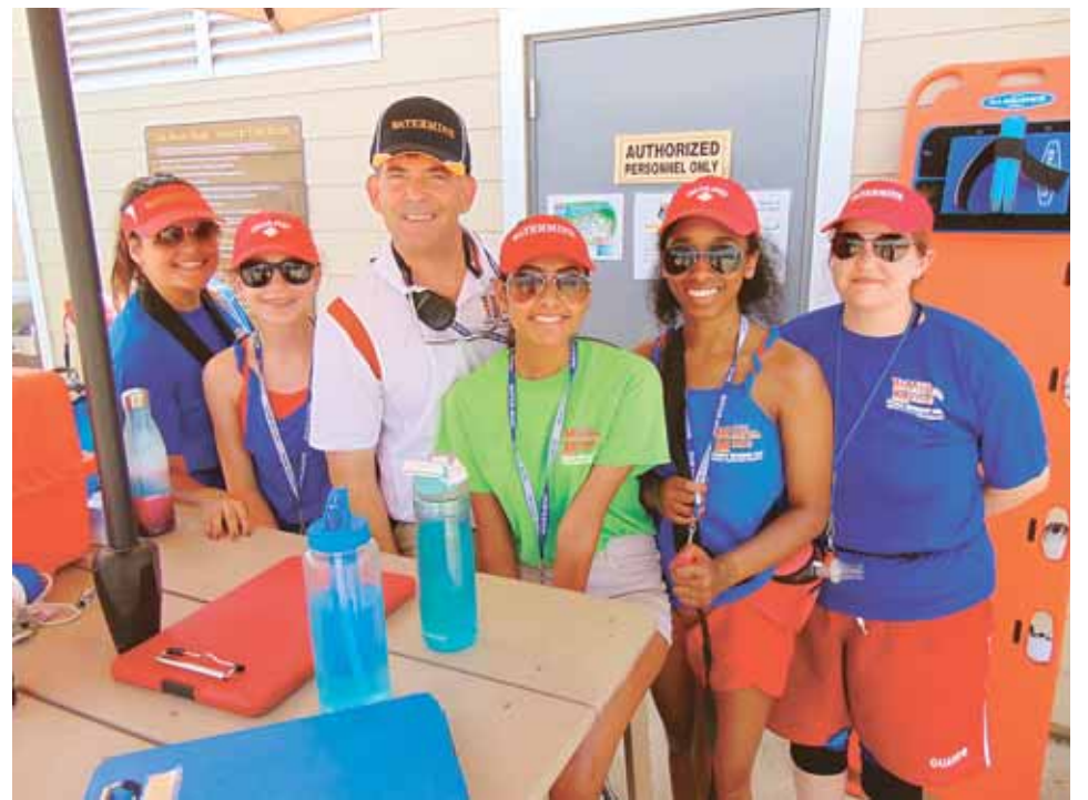
Park attendants and lifeguards at the Water Mine Family Swimmin' Hole at Lake Fairfax in Reston.