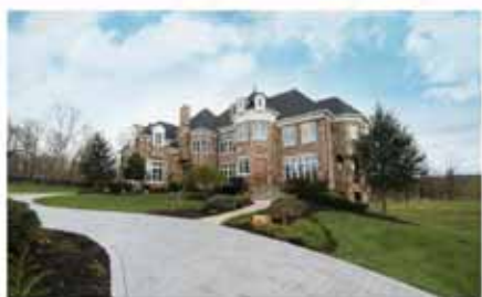
39984 BRADDOCK RD, ALDIE • $1,985,000

MIDDLEBURG (540) 687-6321 PURCELLVILLE (540) 338-7770 LEESBURG (703) 777-1170 ASHBURN (703) 436-0077