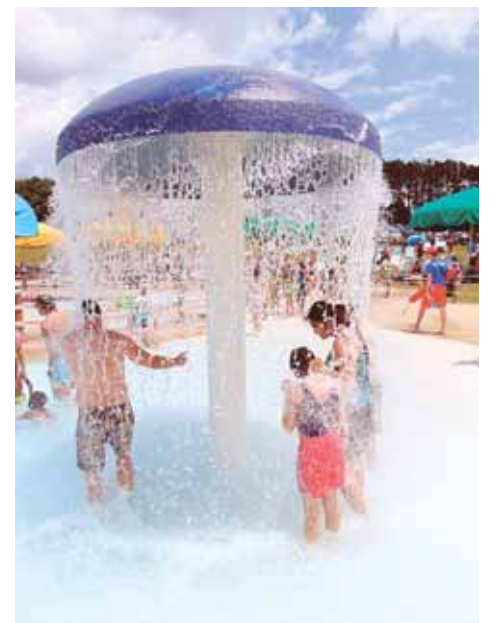
People cooling off under the showers in the 90 degree heat at the Water Mine at Lake Fairfax in Reston.