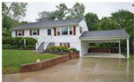
130 26TH ST S, PURCELLVILLE • $389,000