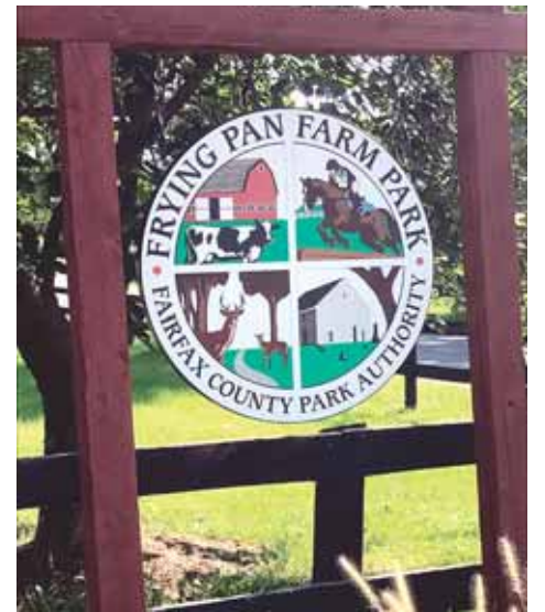
Frying Pan Park, 2709 West Ox Road preserves a 1920s-1950s farm and agricultural process and offers riding lessons, hiking trails, and a farm experience. The grounds include a cross-country course, stadium, indoor riding rings, and live farm animals.

1st Annual Green Lizard Half-Century Fun Ride/Bike-a-Thon, and Rotary Club of Herndon produced a carnival. All HHS Marching Band students who wanted to go,