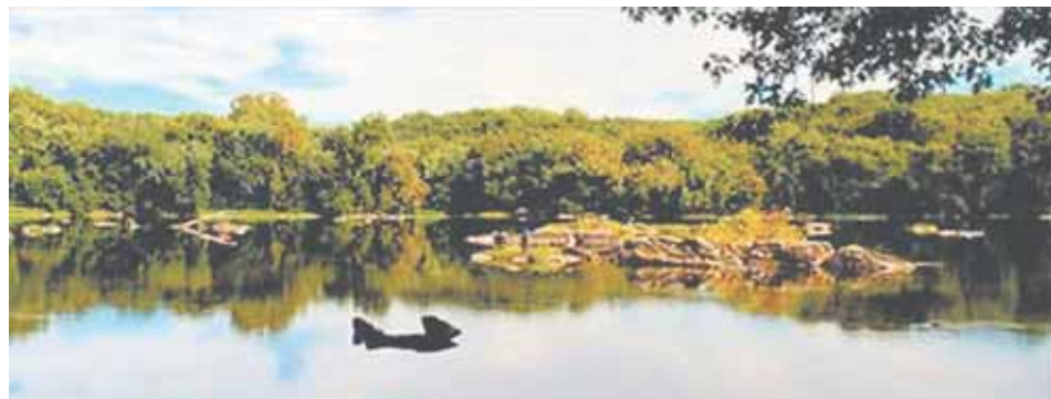
Riverbend Park offers over 400 acres of forest, meadows and ponds.