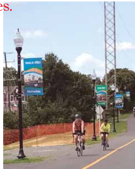
The W & OD Trail is a 44-mile asphalt-surfaced paved trail that runs through the center of Herndon’s downtown. It is suitable for walking, running, cycling, and roller-skating.

“What’s so great about Herndon? It’s the goodness of the people in the town. Here are two examples – one in tragedy and one in celebration. When five newly graduated Herndon High School seniors were involved in a fatal out-of-state car crash, the community came together. They funded expenses to bring three deceased students back home from Texas and to pay for their funerals. On a lighter celebratory note, when the Herndon High School Marching Band was selected to perform in Hawaii at the Pearl Harbor Memorial Parade in 2013, the community raised funds for those students whose families could not afford the expenses. Green Lizard Cycling initiated the