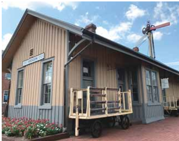
Herndon Depot, 717 Lynn St., houses railroad and historical memorabilia from Herndon late 1800s-1960s and is on the National Register of Historic Places.