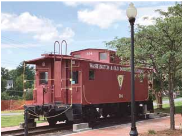
Herndon's Red Caboose, 742 Lynn St., is the symbol of Herndon's bygone railroad that for so many years furnished passenger service and carried mail, freight, and milk from local farming communities to larger cities.