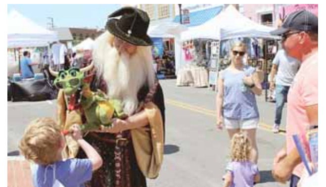
The four day annual Herndon Festival attracts 80,000 people and is the largest free festival in the state. It features three stages of entertainment, arts and crafts booths, food vendors, business expo, and carnival, as well as two days of children’s hands on art activities.