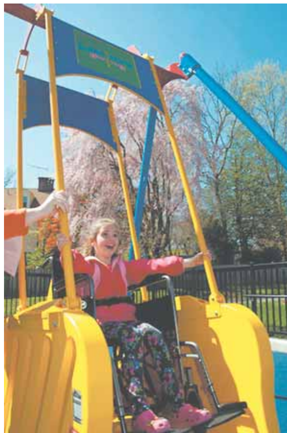
Clemyjontri Park: A unique playground where children of all abilities can play side-by-side.

The Town of Herndon is located in the Dranesville District. The town owns and maintains this 58-acre park. It is the site for many community nature-related events such as the annual Nature Fest. Situated near the Sugarland Run Stream, the park attracts over 100 species of birds, deer, fox and other wildlife. Two park shelters are