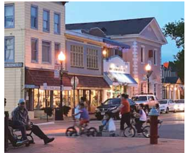
Station Street, Downtown Herndon on a summer night in 2017.