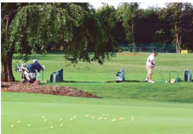
Herndon Centennial Golf Course, 909 Ferndale Ave., is described as one of the best municipal golf courses in the Washington metropolitan area.

regardless of income, performed in Hawaii, expenses paid in full for those who needed assistance.”