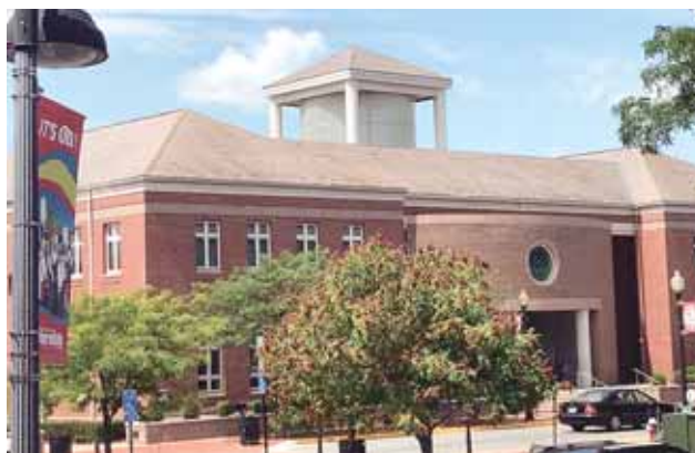
The Herndon Municipal Center complex at 777 Lynn St. includes a branch of the Fairfax County Library system, government offices, the Herndon Council/District Court meeting facility and the Town Green for special events and concerts.