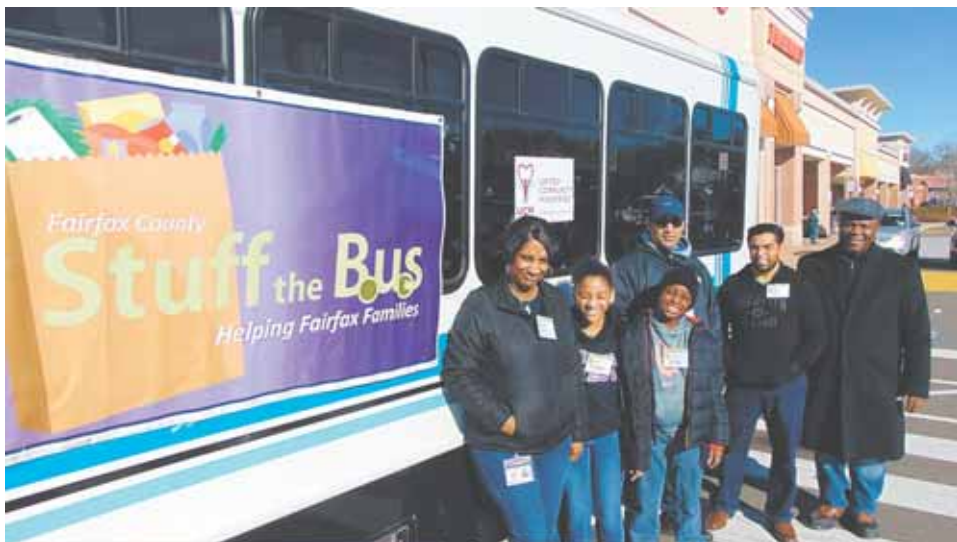
Volunteers for Stuff the Bus at the Shoppers Food Warehouse at Mt. Vernon Plaza along Route 1.