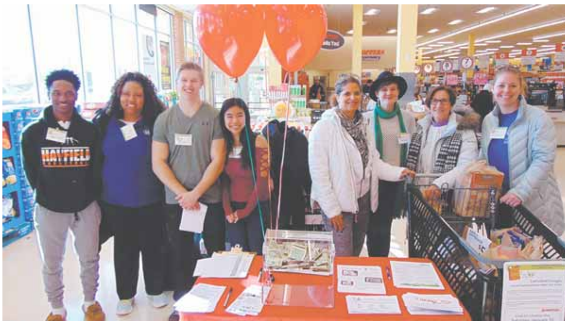
A mix of volunteers at Shoppers Food Warehouse at Mt. Vernon Plaza from Fairfax County, Neighborhood and Community Services, Office of Public, Private Partnerships, and MV Transportation.

REQUESTED IN HOME MATERIAL TIME-SENSITIVE POSTMASTER: ATTENTION