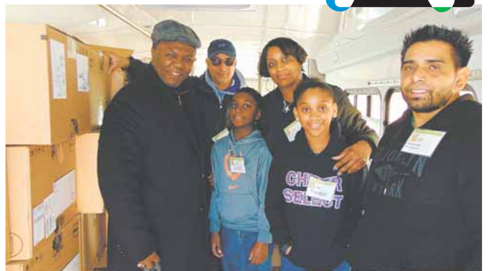
Volunteers for Stuff the Bus with collected food at the Shoppers Food Warehouse at Mt. Vernon Plaza along Route 1.