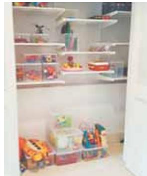
Teaching children to put away toys at the end of the day can create a peaceful environment.