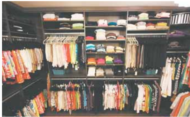
Small tasks such as putting away clothes each day can lead to an organized space.