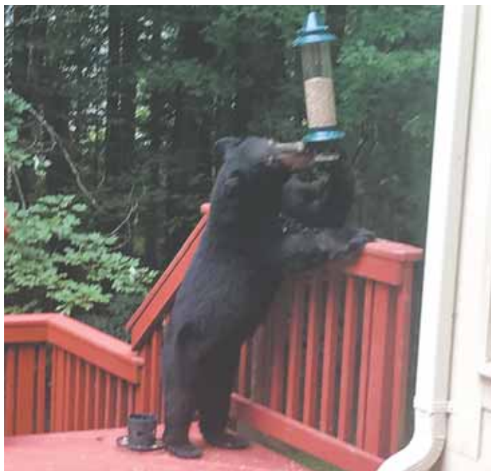
Bear on the Deck.

By e-mail: editors@connectionnewspapers.com