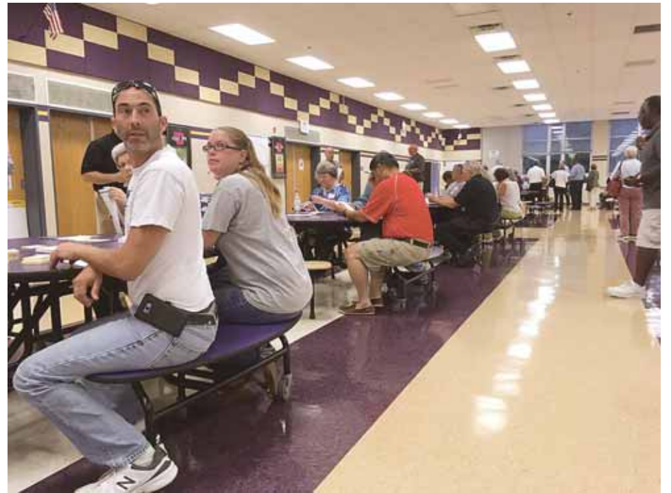
Each group focused on one of nine topics.