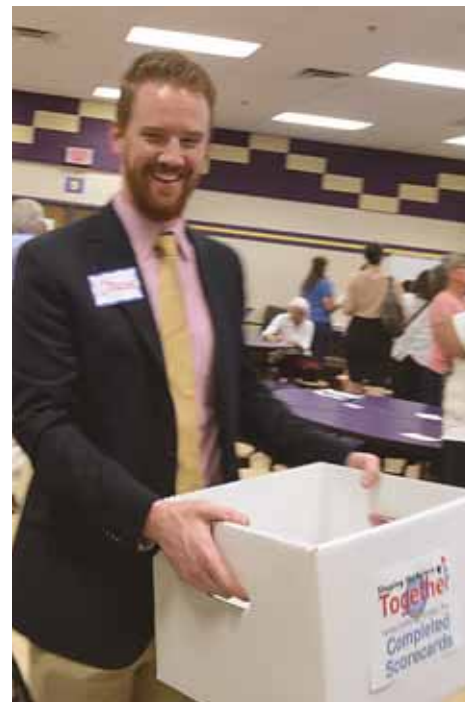
Early on, comment forms were collected.

pecting everyone in the county. It was presented in a booklet that each participant took as they went to the various stations to