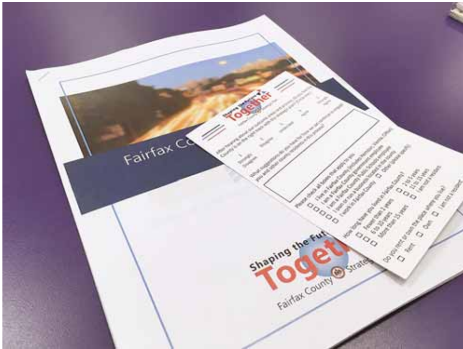
Booklet and form are an important way to gather feedback.