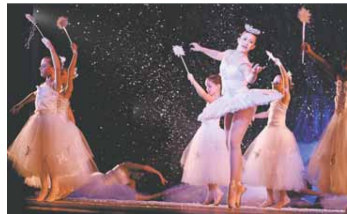
The Nutcracker performed by the Metropolitan School of the Arts.

For more information on upcoming events and tickets, visit www.metropolitanarts.org