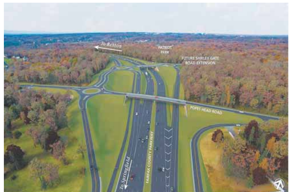
At Popes Head Road, eliminating the traffic signal will improve the traffic flow through here.