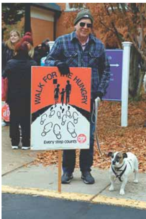
Walkers carry signs in support of the effort.