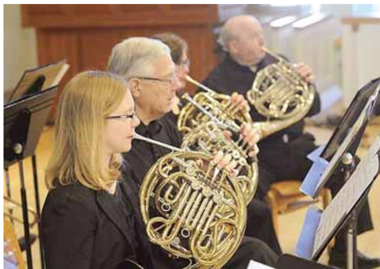
The Cathedral Brass will put on a concert on Saturday, Dec. 7 at Living Savior Lutheran Church in Fairfax Station.

Winter Wonderland. 12 p.m. to 5 p.m. At Burke Lake Park, 7315 Ox Road, Fairfax Station. At Winter Wonderland, you can hop a train ride on the Holiday Express, take unlimited spins on the Carolers Carousel, play Gingerbread Man Golf or cook s'mores by the fire. Visit with Santa and enjoy hot chocolate or cider and candy canes. Five-hour passes are $15 in advance and $20 on the event day. The park will also be accepting new toys or canned food