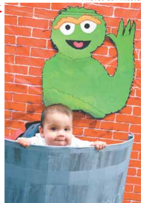
A young patron gets her photo taken with Oscar the Grouch in a specially crafted trash can made just for the event.

part of the circuit, helping get Cookie Monster out of a maze. The kids really seemed to enjoy it, and I had a great time with them!"