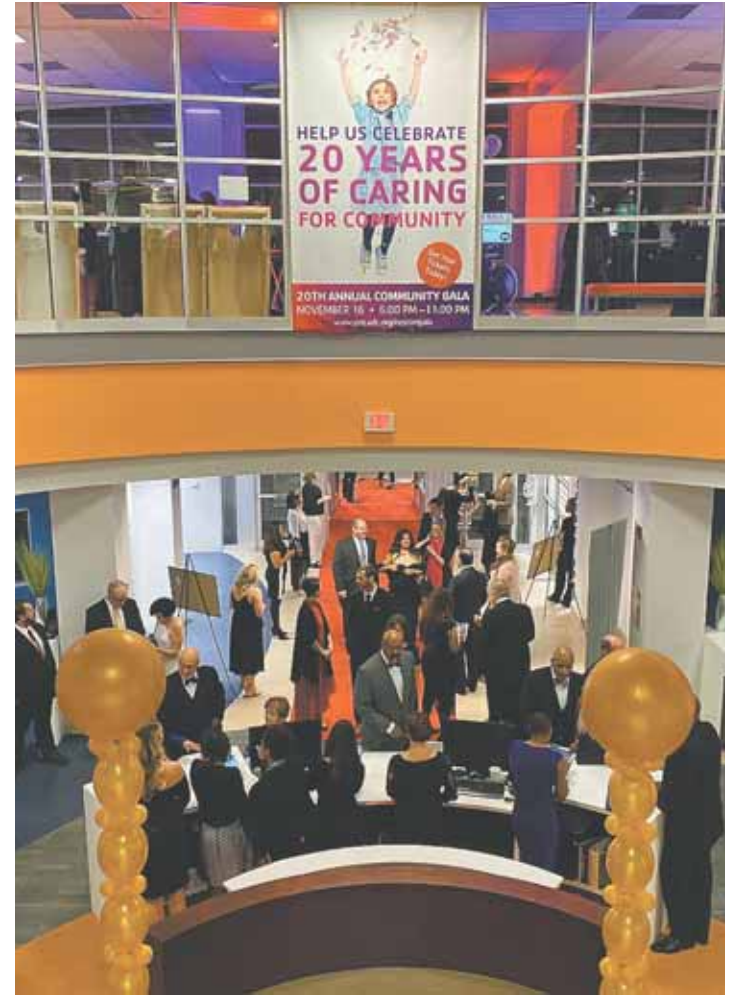
Attendees walk the red carpet as they enter the YMCA Fairfax County Reston 20th Annual Fundraising Gala held Nov. 16.