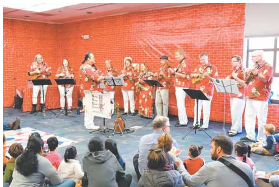
The Northern Virginia Ukulele Society performs classic Sesame Street songs like "Sunny Day" and "I love Trash" during a performance at the Reston Regional Library.