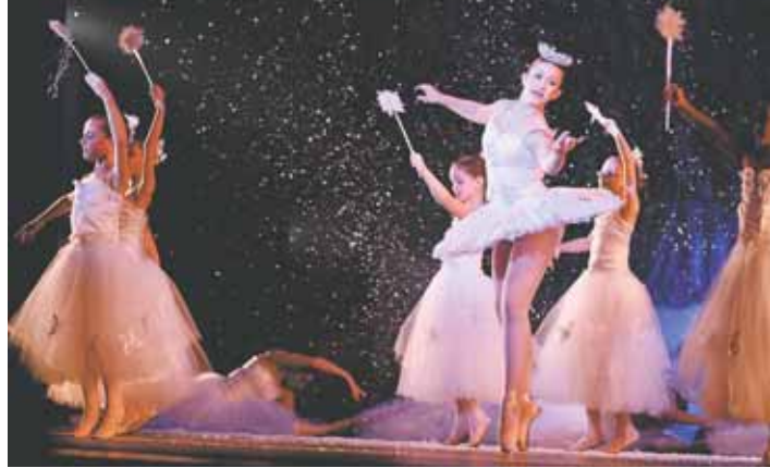
The Nutcracker performed by the Metropolitan School of the Arts.

For more information on upcoming events and tickets, visit www.metropolitanarts.org