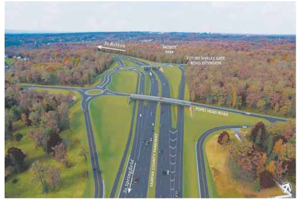
At Popes Head Road, eliminating the traffic signal will improve the traffic flow through here.

The project will also include improving the Route 123 interchange, the Fairfax County Parkway/Burke Centre Parkway intersection, and a section of a shared-use path. This is a missing segment on the shared-use path between Burke Centre Parkway to Route 123.