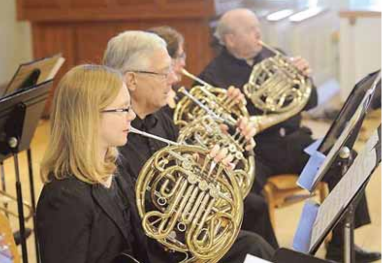
The Cathedral Brass will put on a concert on Saturday, Dec. 7 at Living Savior Lutheran Church in Fairfax Station.

Winter Wonderland. 12 p.m. to 5 p.m. At Burke Lake Park, 7315 Ox Road, Fairfax Station. At Winter Wonderland, you can hop a train ride on the Holiday Express, take unlimited spins on the Carolers Carousel, play Gingerbread Man Golf or cook s'mores by the fire. Visit with Santa and enjoy hot chocolate or cider and candy canes. Five-hour passes are $15 in advance and $20 on the event day. The park will also be accepting new toys or canned food