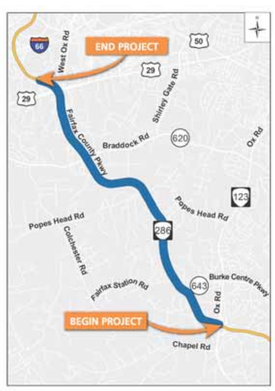
The Virginia Department of Transportation

The plans are to widen about five miles of Fairfax County Parkway from four lanes to six through this corridor, and redo the Popes Head Road interchange using triple roundabouts that will allow traffic to flow freely via two new bridges over the parkway. At that interchange, there will be access to the future Shirley Gate Road exten-