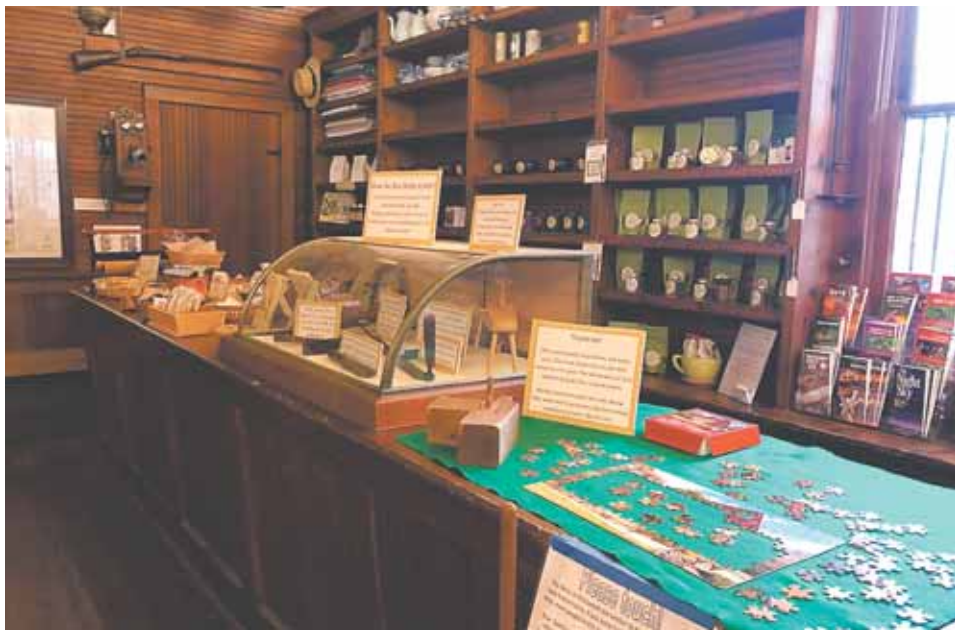
The original general store counter, topped with toys and mill-building tools.