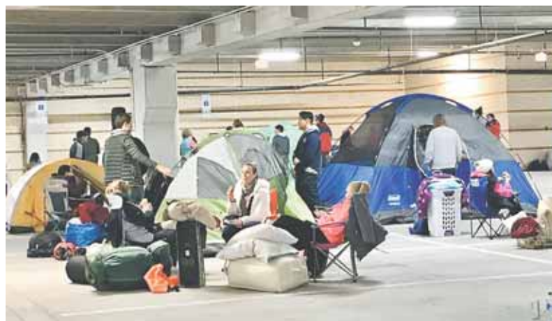
Campers pitch their tents overnight at Vienna's Chick-fil-A at Maple Ave.

I am committed to developing my team members as we provide a remarkable experience to our guests who become