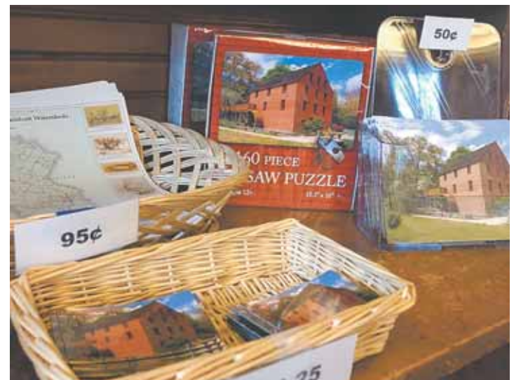
Postcards, puzzles, and other Colvin Run Mill-related things for sale.

or not, there's something about giving a gift that is significant to that area or time period, something that was ground on site the