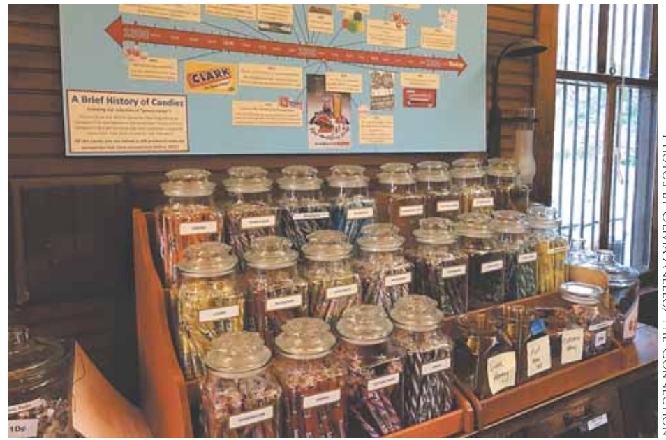
Old-fashioned penny candy in every flavor.