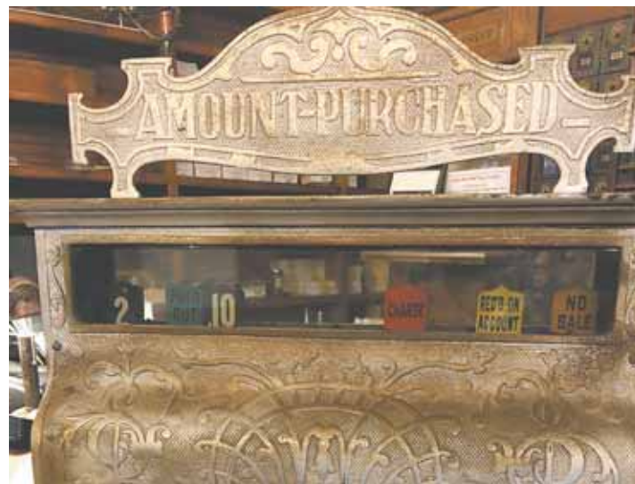
An antique register sits on the counter from around the time period the general store opened.