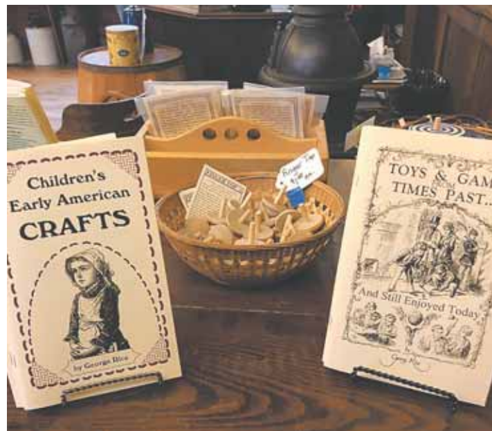
Some of the many children's activities available to purchase at the general store.