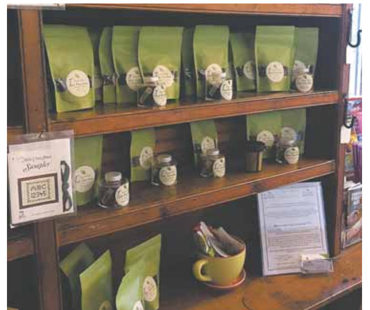
Diverse and delicious tea leaves from Great Falls Tea Garden. The business also holds educational tea seminars at the Colvin Run Mill site.