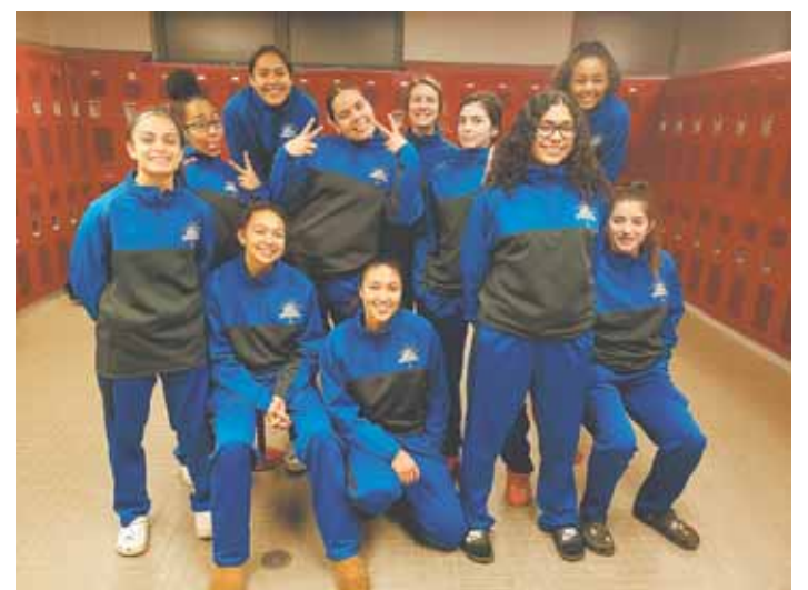
Through hard work, discipline, and focus Lee High girls basketball team was able to regroup and create a winning record.