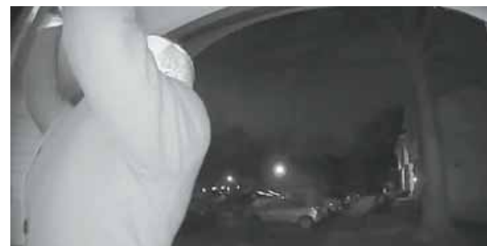
PHOTOS FROM DOORBELL CAMERA